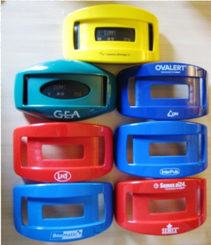
The Brand: GEA has a different shape