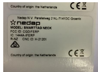
Model SmartTag Neck (I)FERP4