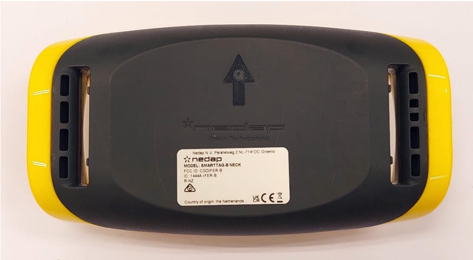
Fig. 2 - Rear side with typelabel