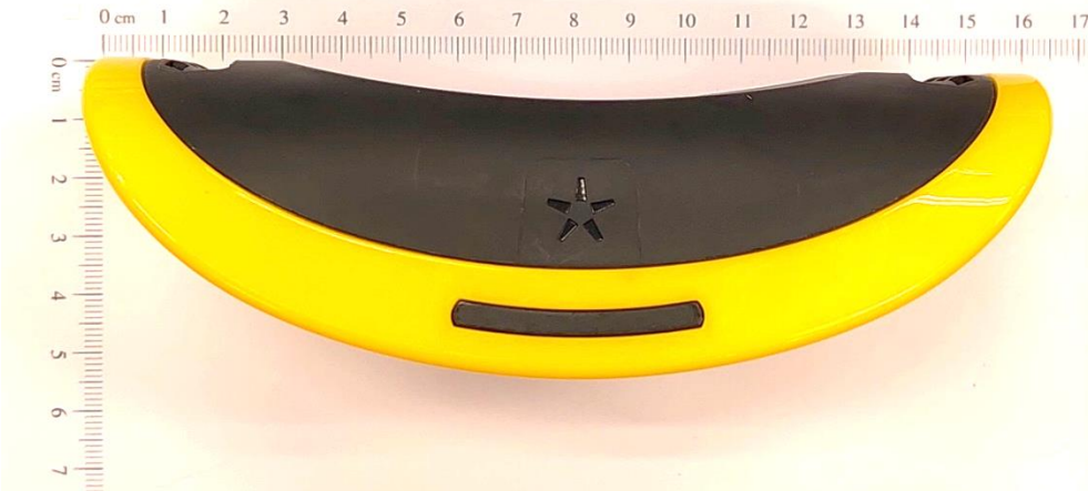
Fig. 5 - Top side