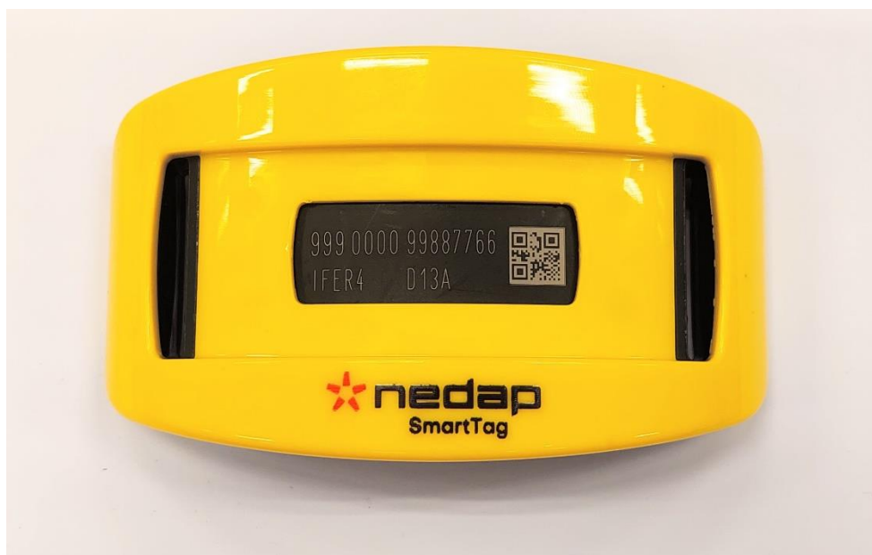
Fig. 1 – Front side with marking (example)

Model SmartTag-B Neck IFER4 is considered as representative for this document since it contains the maximum features.