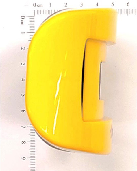
Fig. 3 - Right side