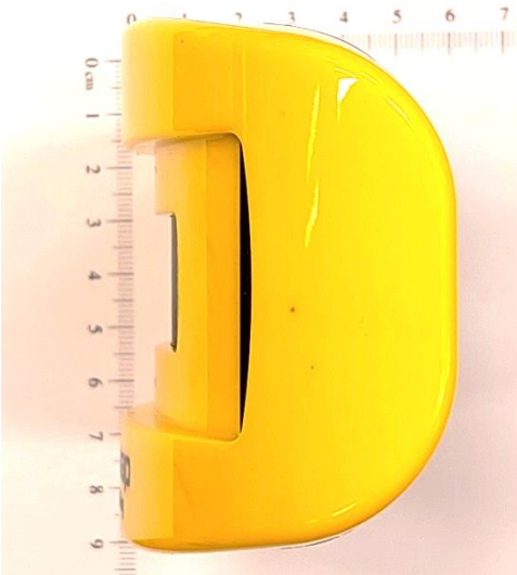
Fig. 4 - Left side