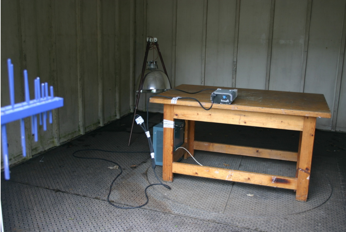
EUT placed horizontal