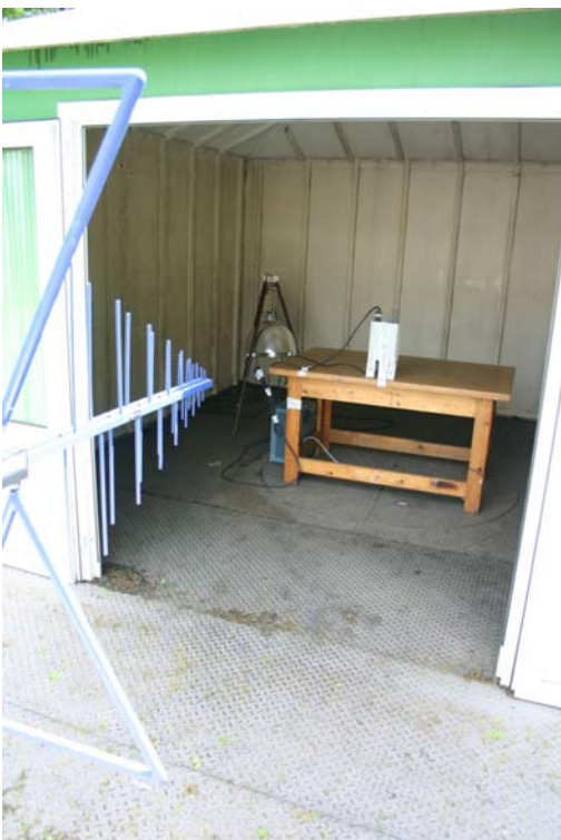
EUT placed vertical