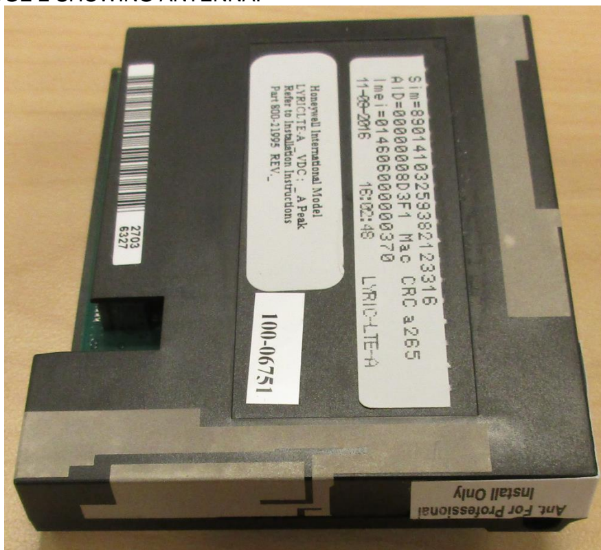
Label on right covers antenna port.