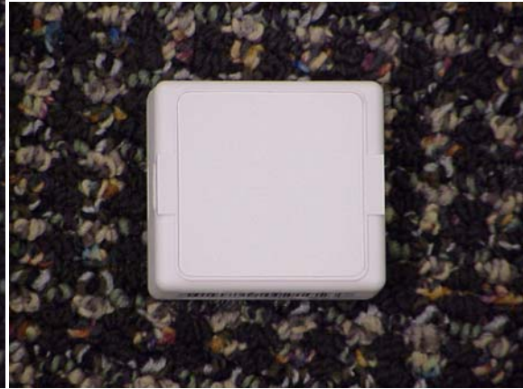
EXTERNAL - BOTTOM