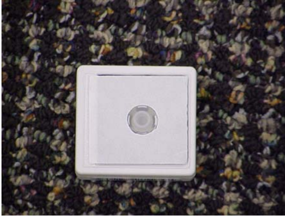
EXTERNAL - TOP