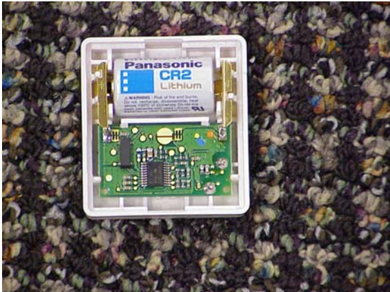
INTERNAL - PCB IN PLASTIC