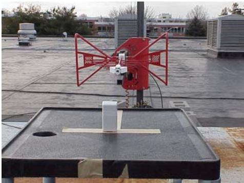
SENSE ANT: VERT, UUT VERT