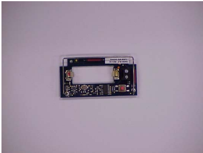
BOTTOM OF THE PCB