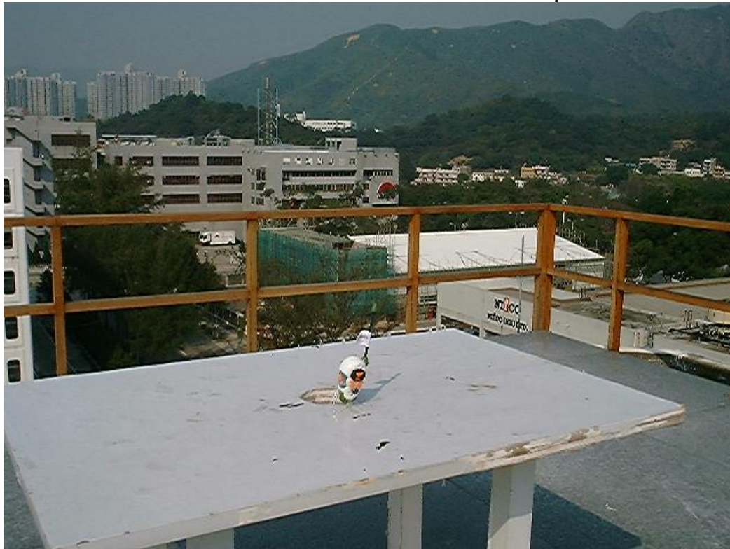
Measurement of Radiated Emission Test Set Up