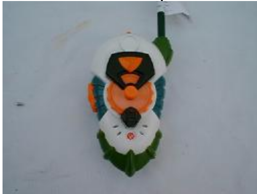
Front View of the product