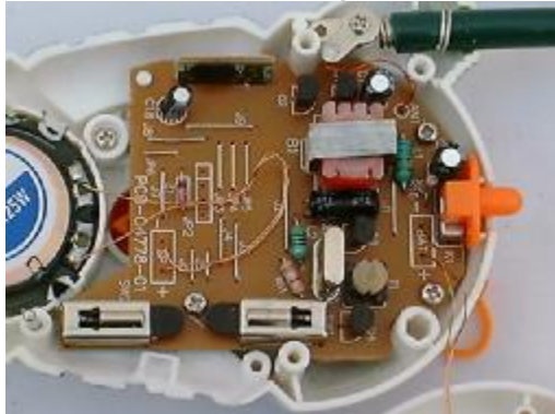
Inner Circuit Top View