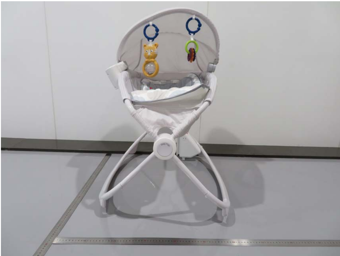
Left View of EUT