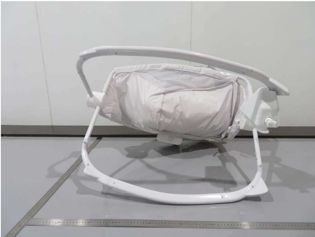
View of Adapter