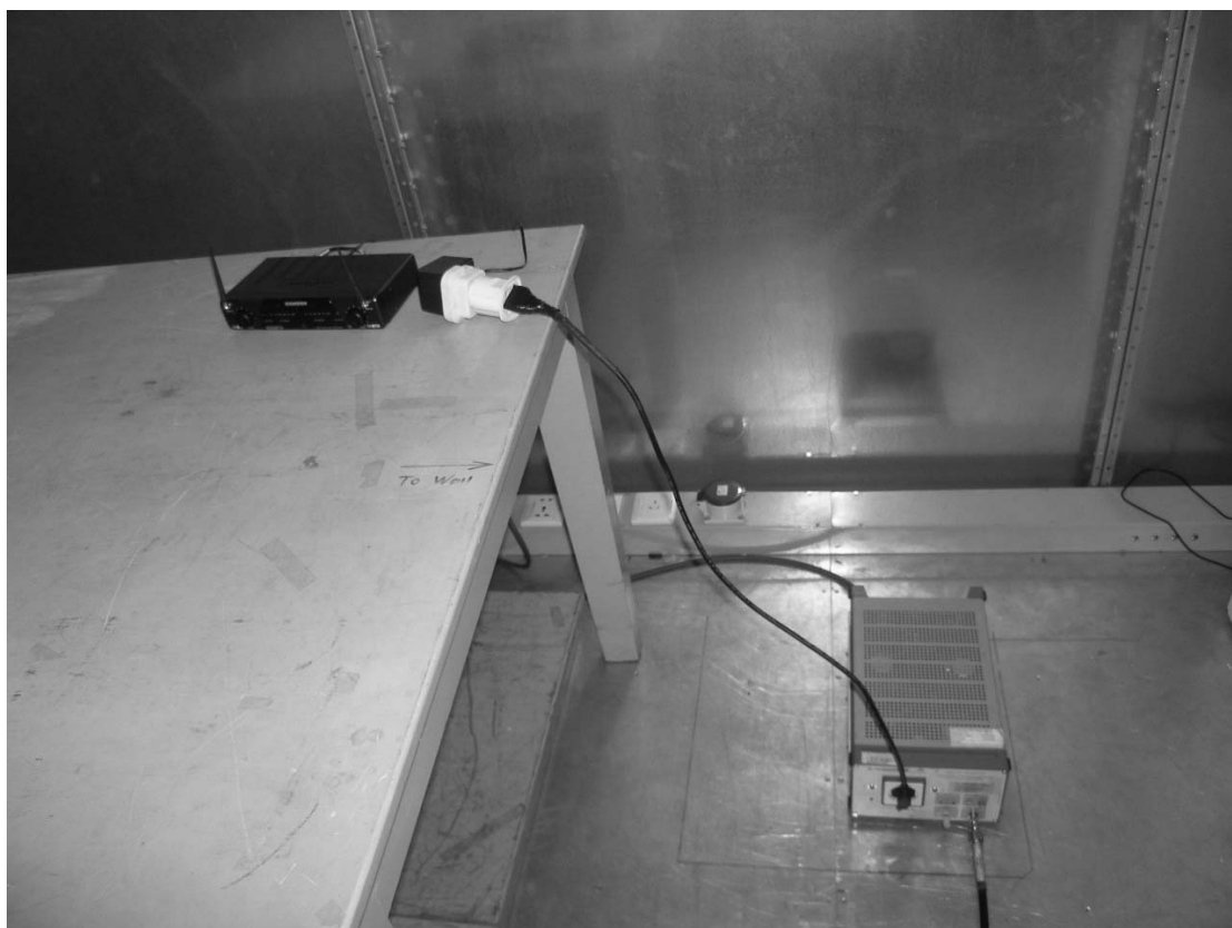
Photograph 1: Set up for Conducted Emission on AC Mains