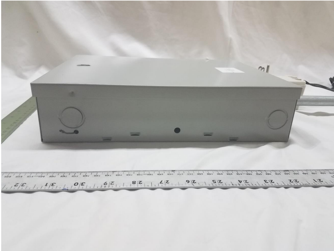
Figure 3. Side 1

FCC Part 15 Certification/RSS 247 CCKPC0252 5251A-PC0252 24-0308 October 7, 2024 Digital Monitoring Products, Inc. XT75