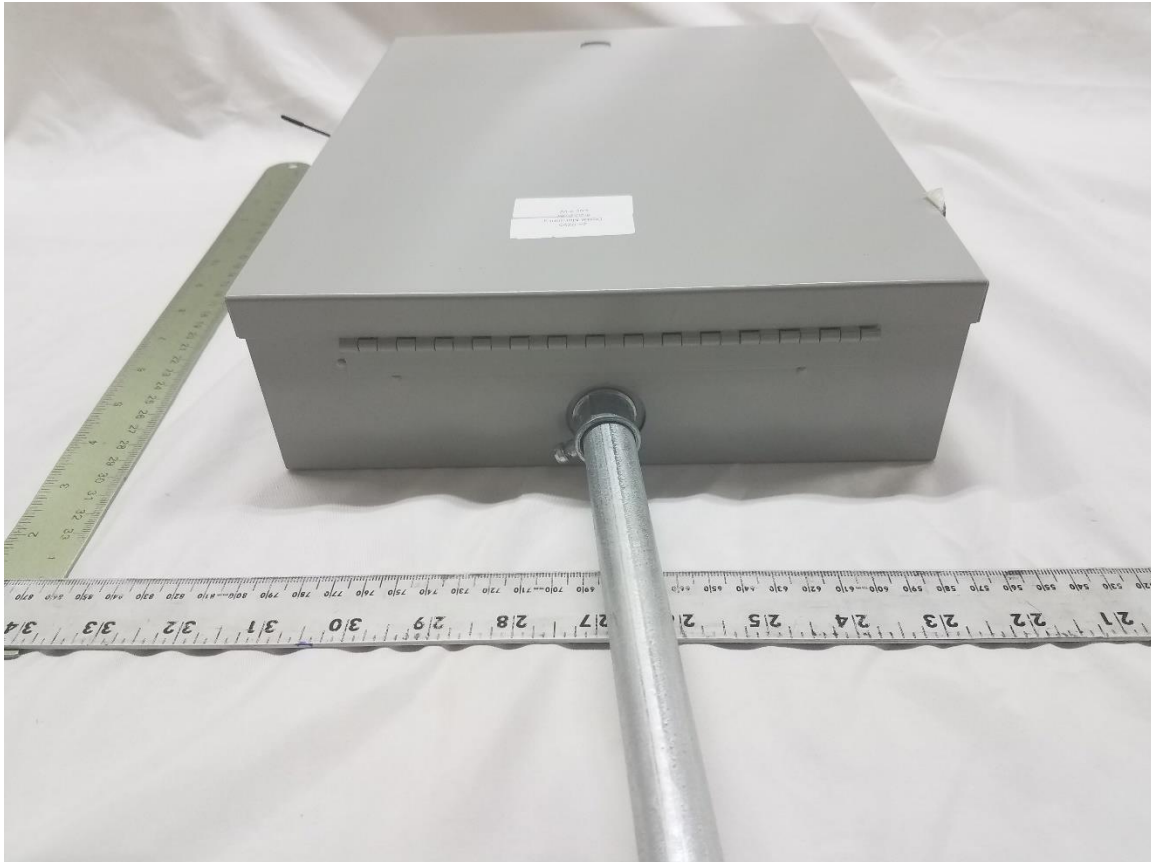
Figure 6. Side 4

FCC Part 15 Certification/RSS 247 CCKPC0252 5251A-PC0252 24-0308 October 7, 2024 Digital Monitoring Products, Inc. XT75