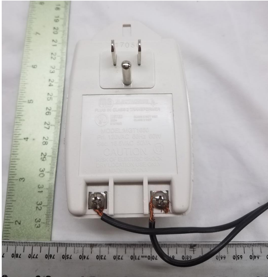
Figure 7. AC Power Supply

FCC Part 15 Certification/RSS 247 CCKPC0252 5251A-PC0252 24-0308 October 7, 2024 Digital Monitoring Products, Inc. XT75