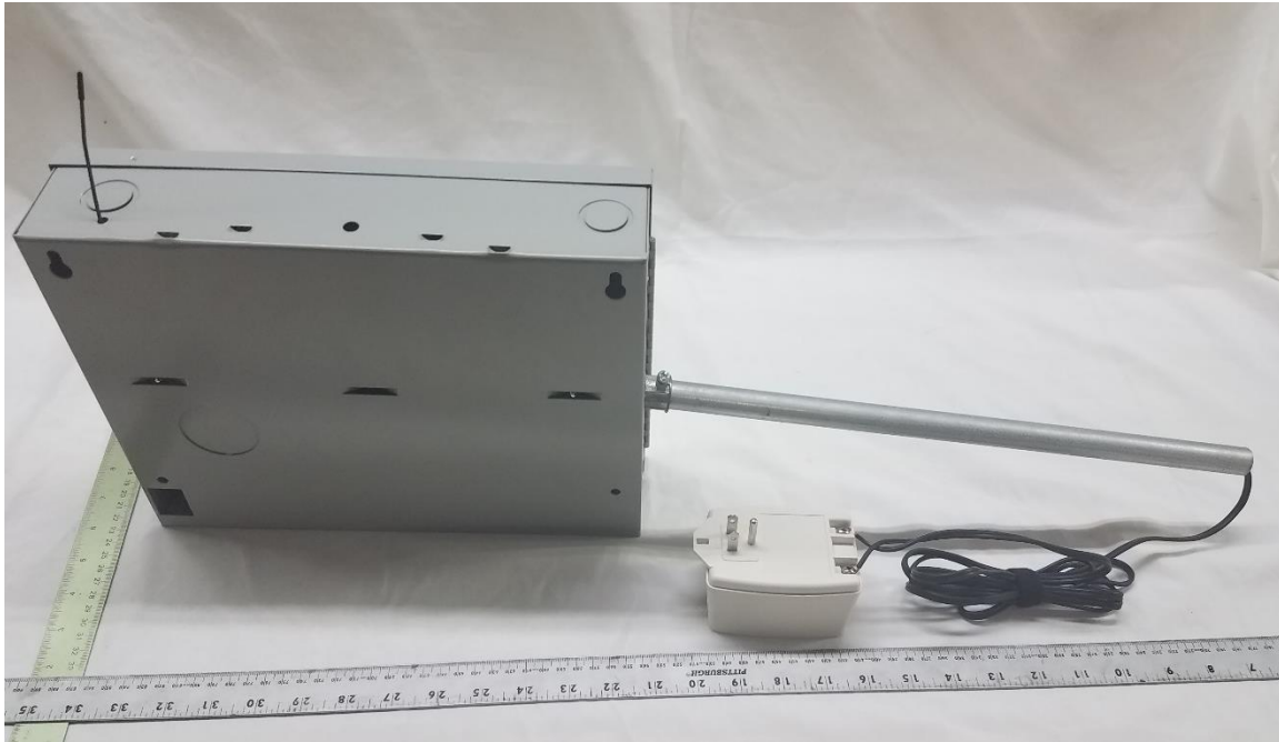
Figure 2. Back of EUT

FCC Part 15 Certification/RSS 247 CCKPC0252 5251A-PC0252 24-0308 October 7, 2024 Digital Monitoring Products, Inc. XT75