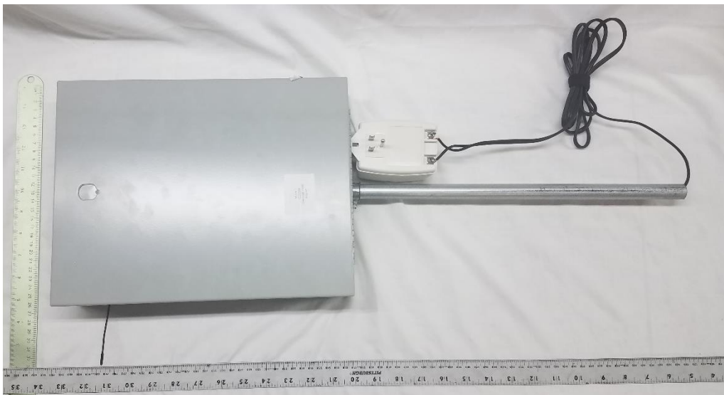
Figure 1. Front of EUT