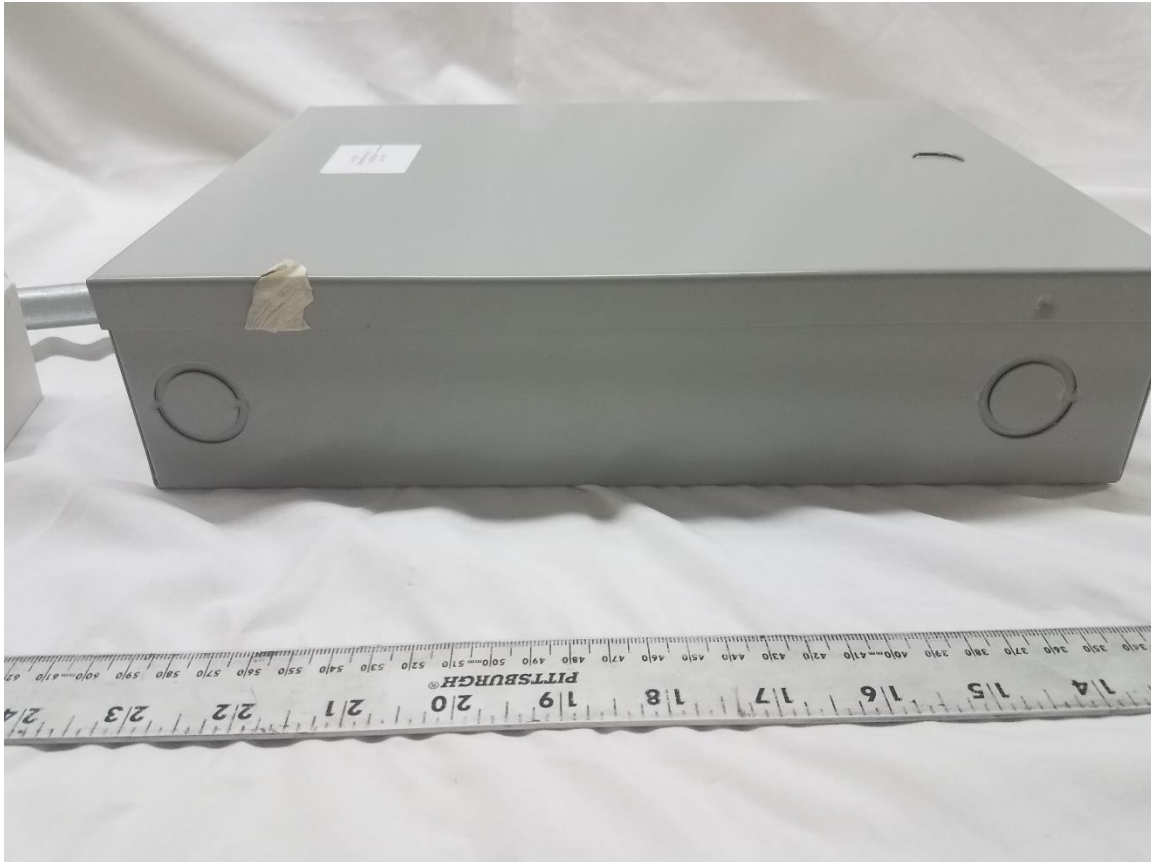
Figure 4. Side 2

FCC Part 15 Certification/RSS 247 CCKPC0252 5251A-PC0252 24-0308 October 7, 2024 Digital Monitoring Products, Inc. XT75