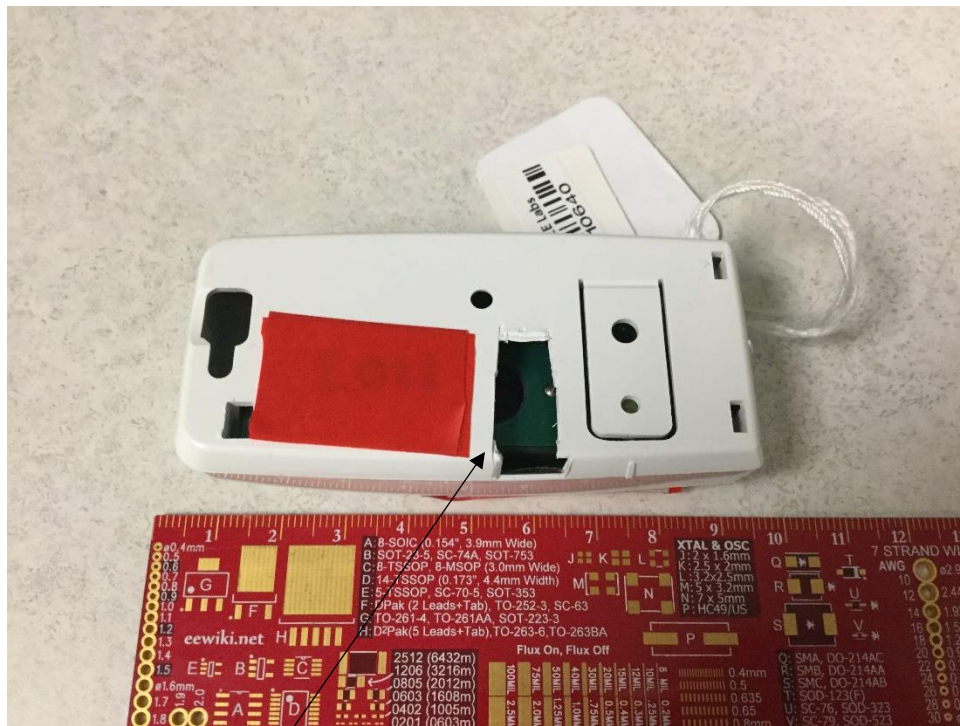
Hole will be plugged for final product. Hole used for testing purposes.