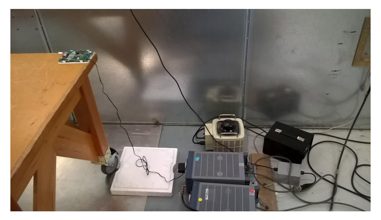
Figure 7 - Conducted Emissions Test Setup