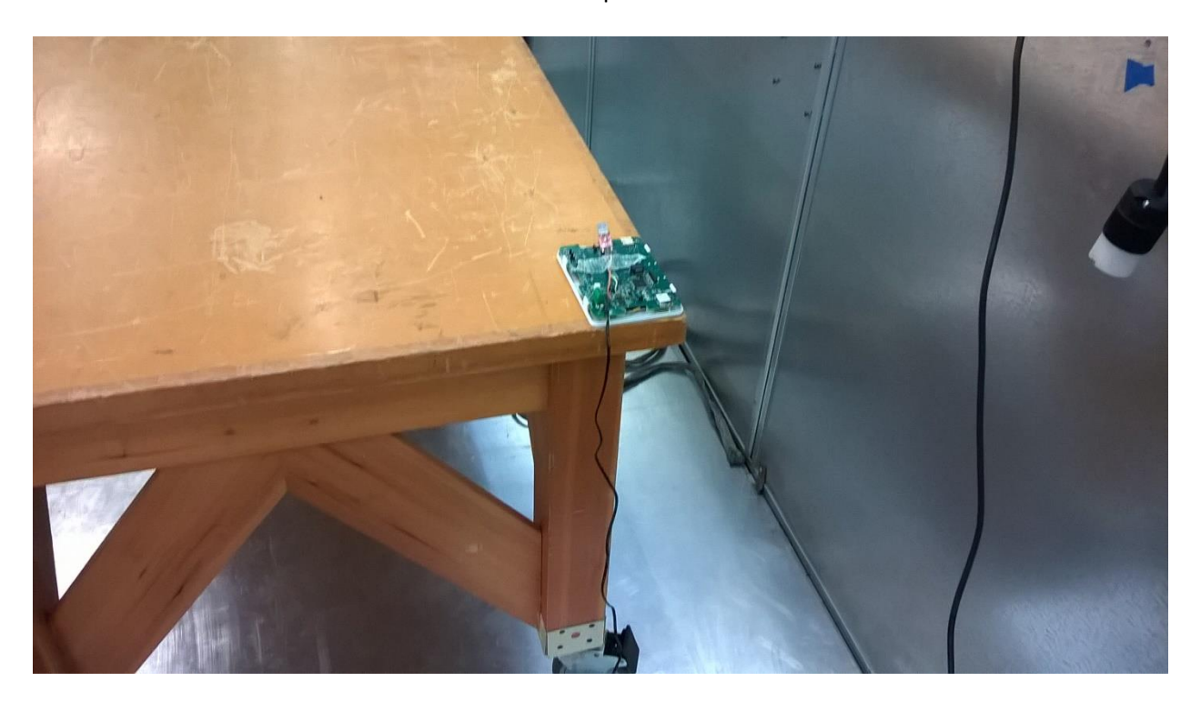
Figure 6 - Conducted Emissions Test Setup