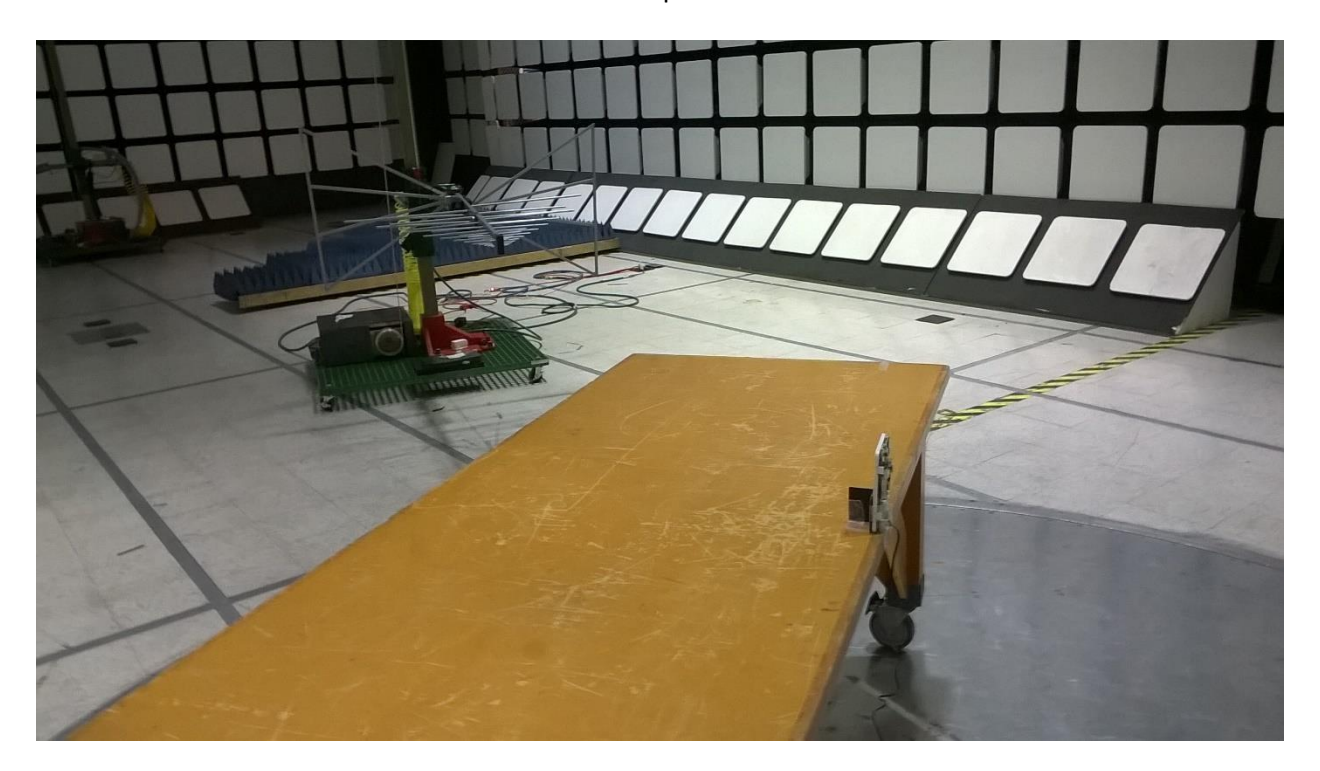
Figure 2 - Test Setup, 30MHz - 1GHz, Z axis (testing was performed in all 3 axis for 30MHz - 1GHz measurements)