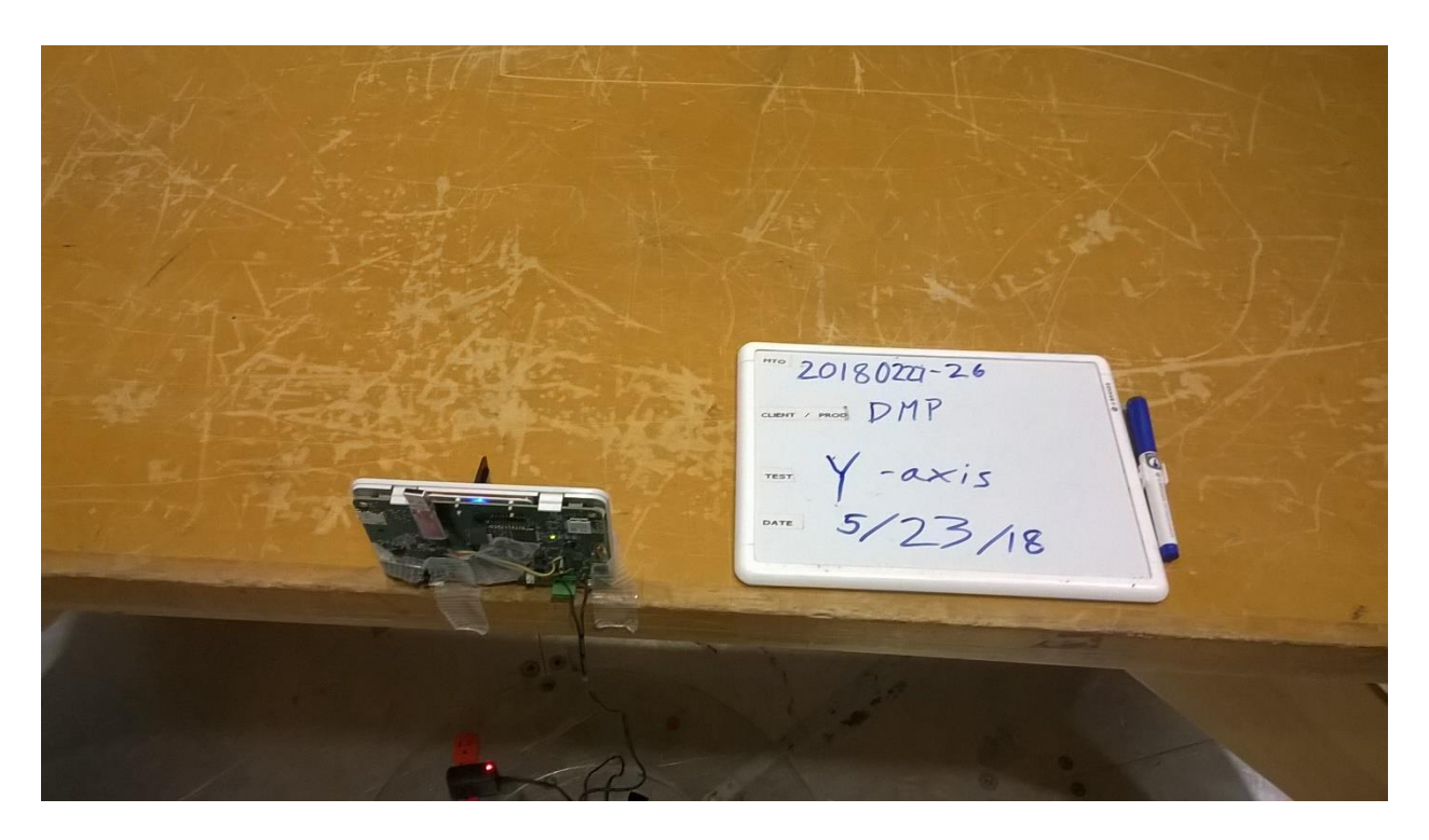
Figure 4 - Test Setup, Y axis