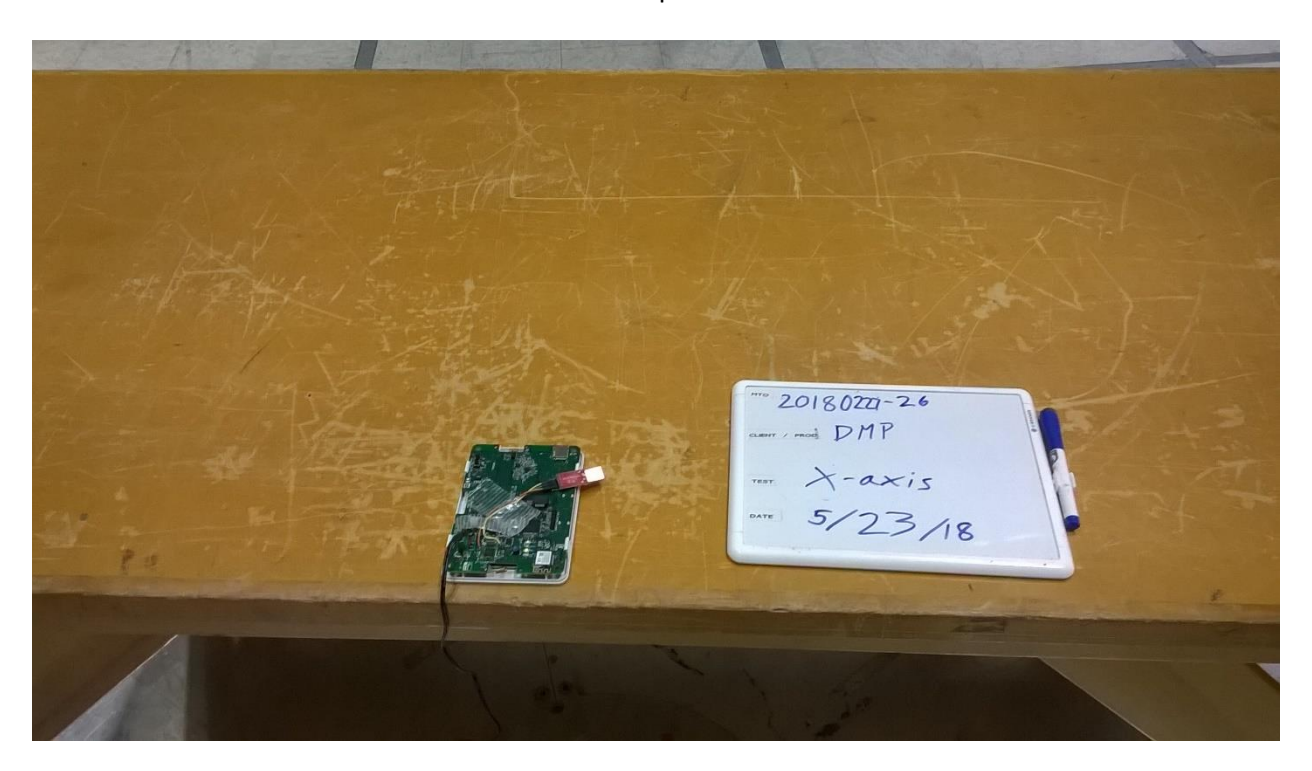
Figure 1 - Test Setup, 30MHz - 1GHz, X axis (testing was performed in all 3 axis for 30MHz - 1GHz measurements)