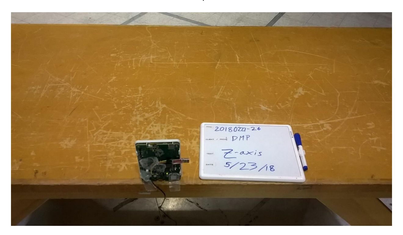
Figure 5 - Z axis