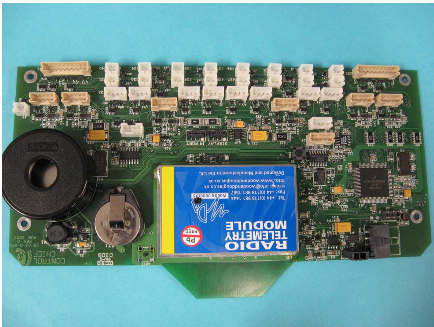
Top of the transmitter board