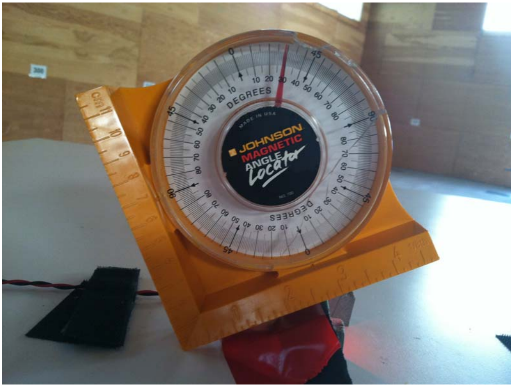
30 degree angle for 1.1 m height