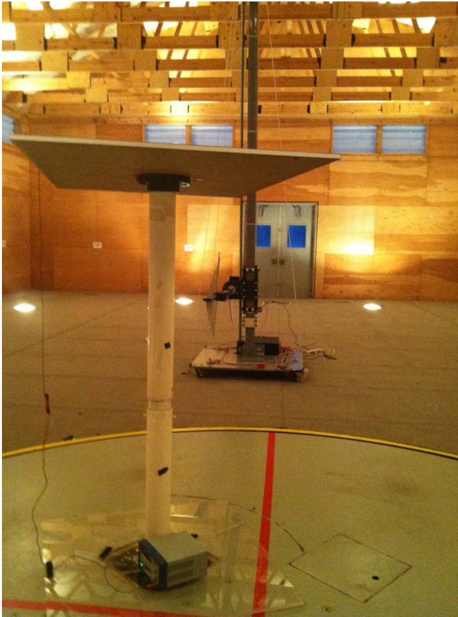
Test Set Up 1.7m Height