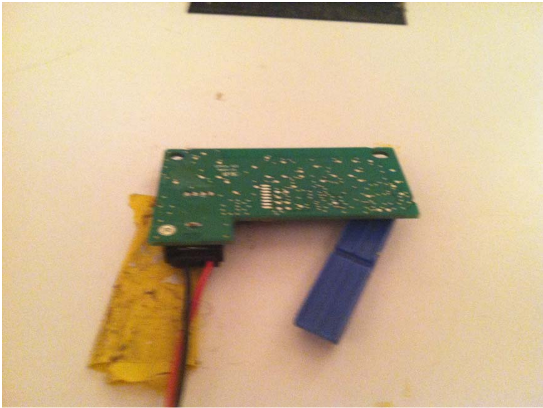
Test Setup flat for 1.4m Height