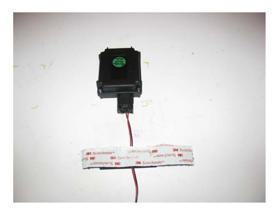
Test Setup – Top View