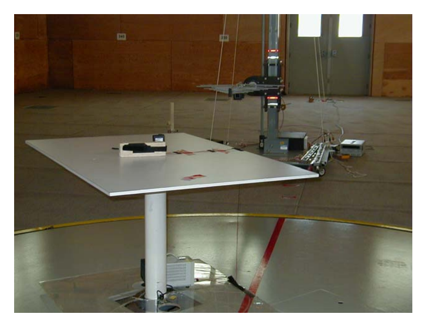
Test Setup - Turntable

Test Setup Photographs Radiated Emissions measurements presented in the report were made in accordance with ANSI C63.4 Figure 9(c). The EUT was placed on a 1 x 1.5m non-metallic table elevated 80cm above a conducting ground plane. The harness was run to the long edge of the table and dropped to a power supply sitting at base of the table.