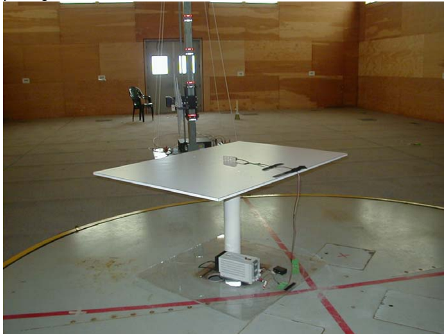
Test Setup - Turntable

Radiated Emissions measurements presented in the report were made in accordance with ANSI C63.4 Figure 9(c). The EUT was placed on a 1 x 1.5m non-metallic table elevated 80cm above a conducting ground plane. The harness was run to the long edge of the table and dropped to a power supply sitting at base of the table.