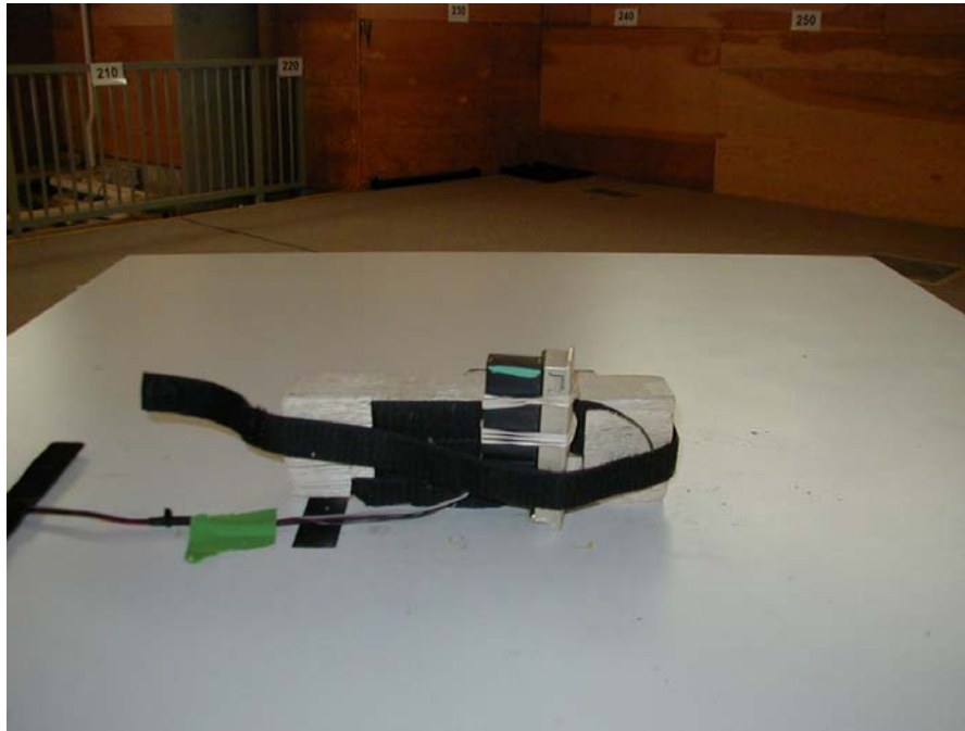
Test Setup – Side View