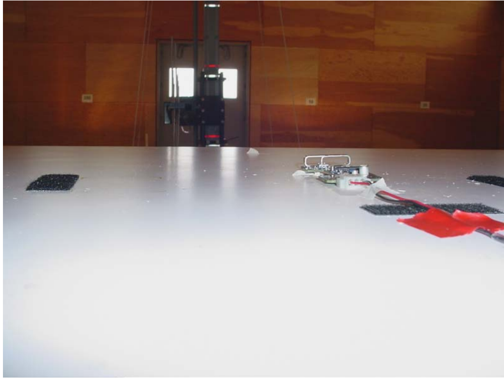
Test Setup – Flat View