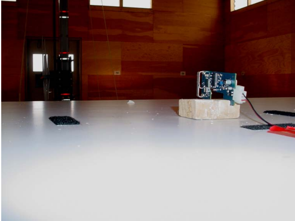
Test Setup – End View