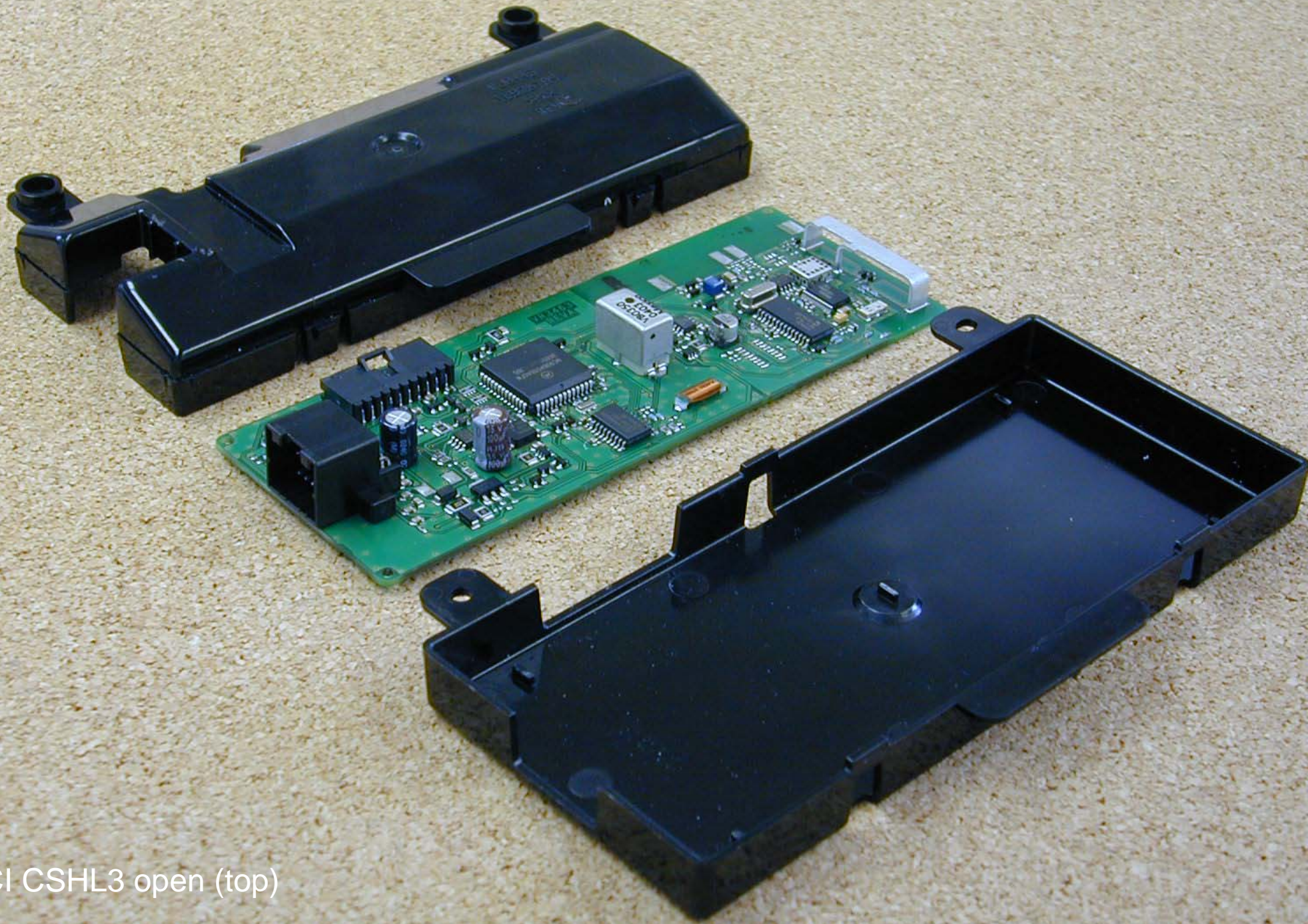
JCI CSHL3 open (top)