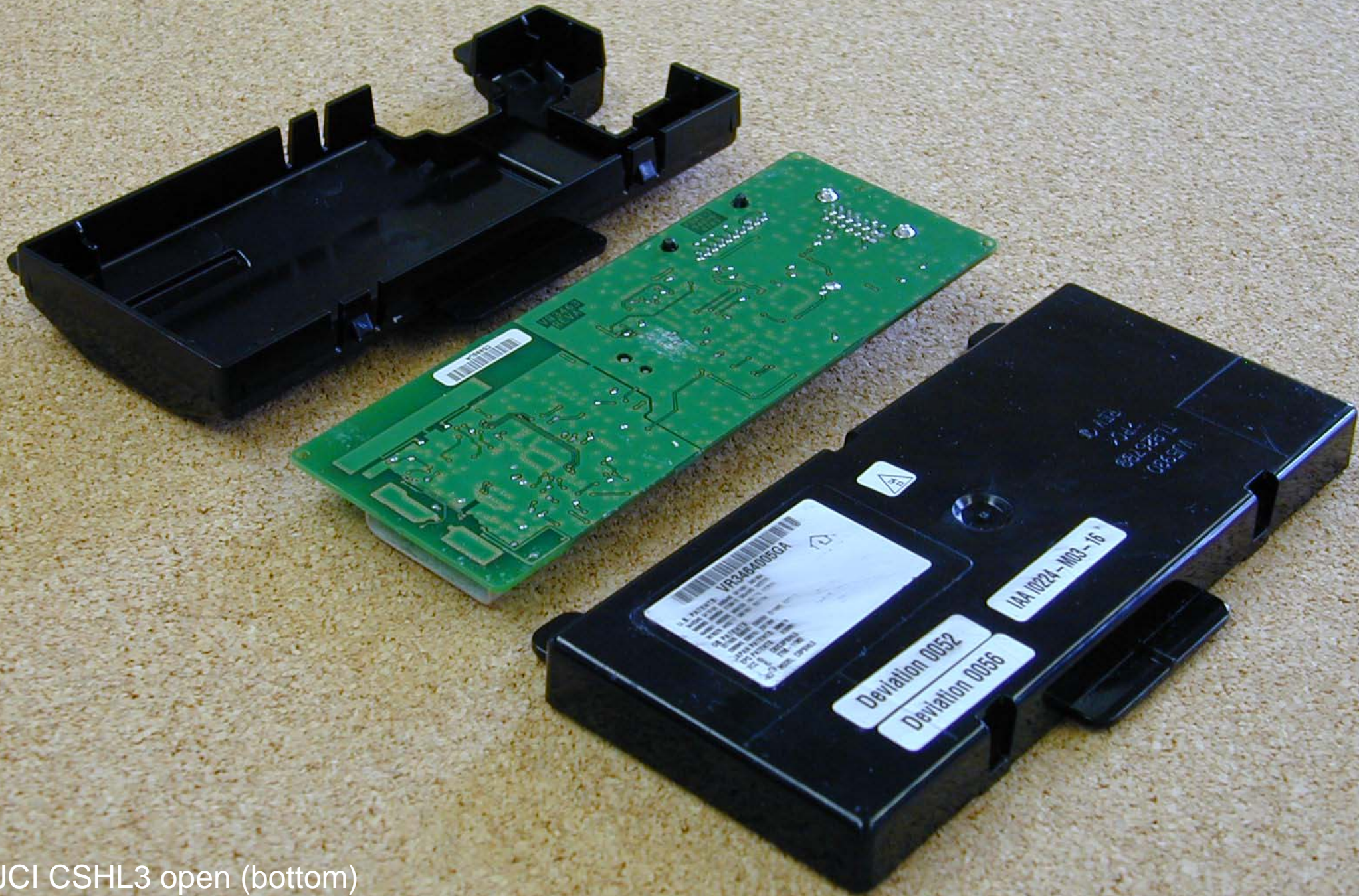
JCI CSHL3 open (bottom)