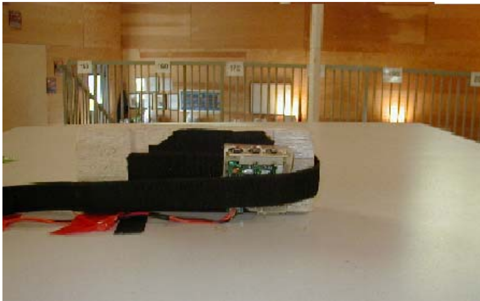
Test Setup – End View