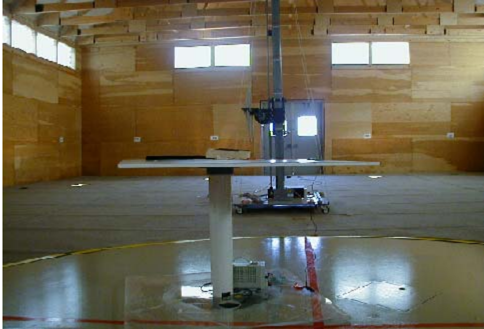
Test Setup - Turntable

Radiated Emissions measurements presented in the report were made in accordance with ANSI C63.4 Figure 9(c). The EUT was placed on a 1 x 1.5m non-metallic table elevated 80cm above a conducting ground plane. The harness was run to the long edge of the table and dropped to a power supply sitting at base of the table.