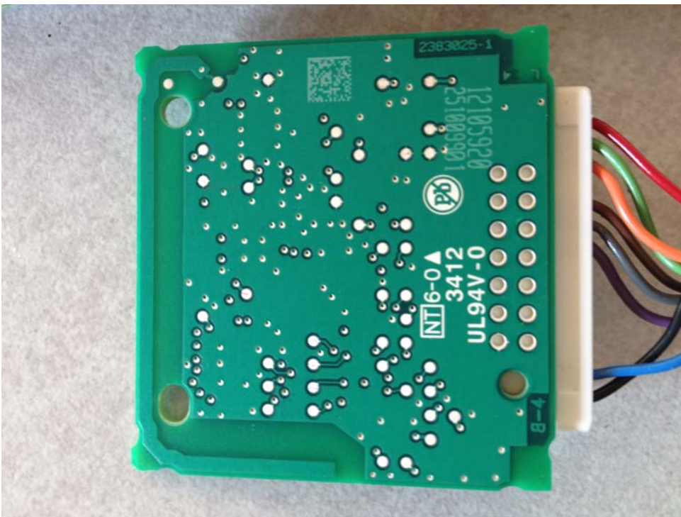
Internal View- Rear PCB side