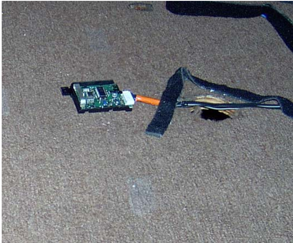
Test Setup – Flat View