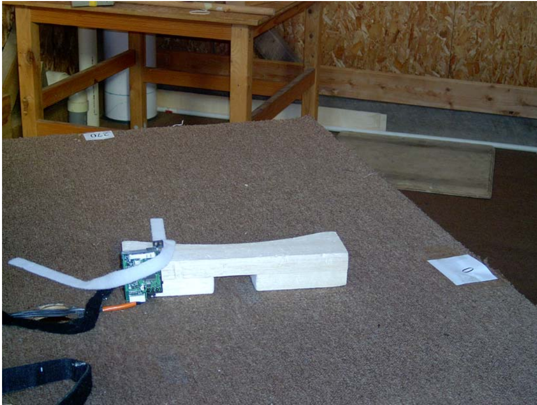
Test Setup - Turntable

Radiated Emissions measurements presented in the report were made in accordance with ANSI C63.4 Figure 9(c). The EUT was placed on a 1 x 1.5m non-metallic table elevated 80cm above a conducting ground plane. The harness was run to the long edge of the table and dropped to a power supply sitting at base of the table.