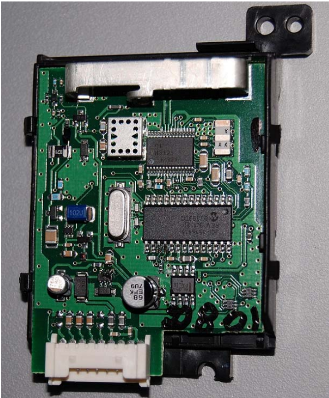
Internal View- Front