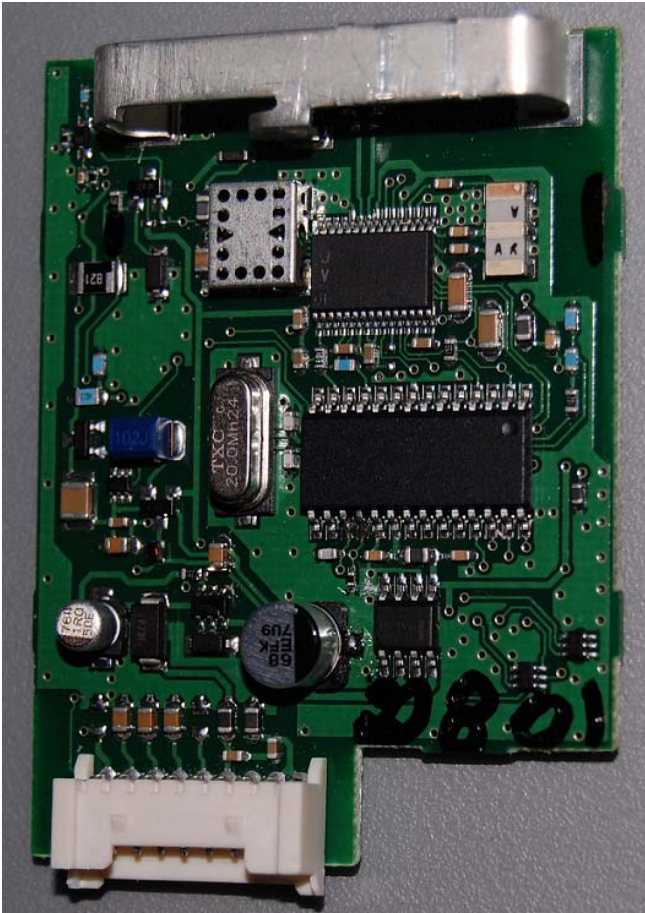
Internal View- Front PCB side