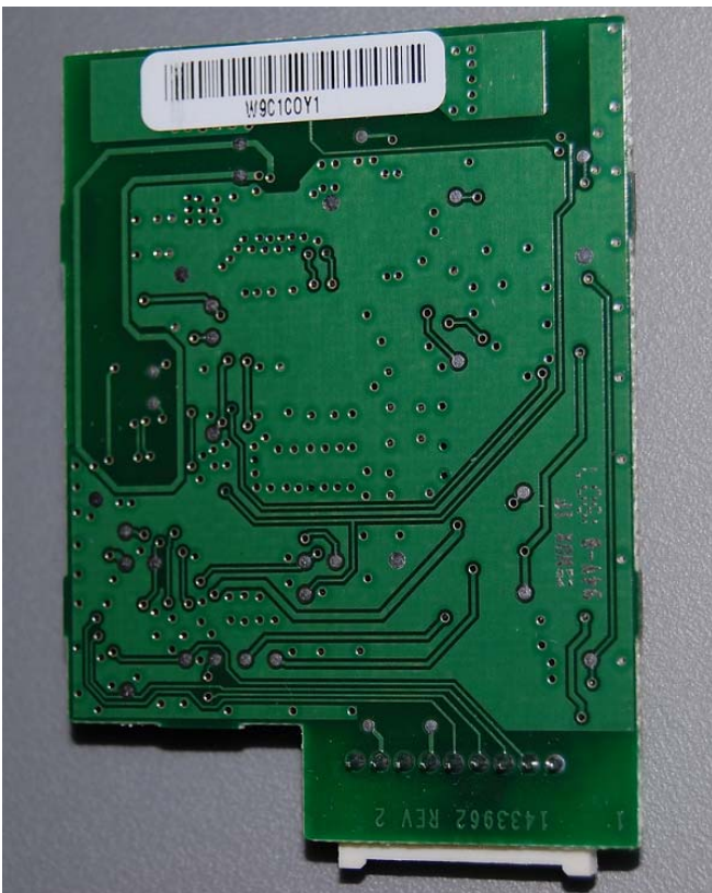
Internal View- Rear PCB side