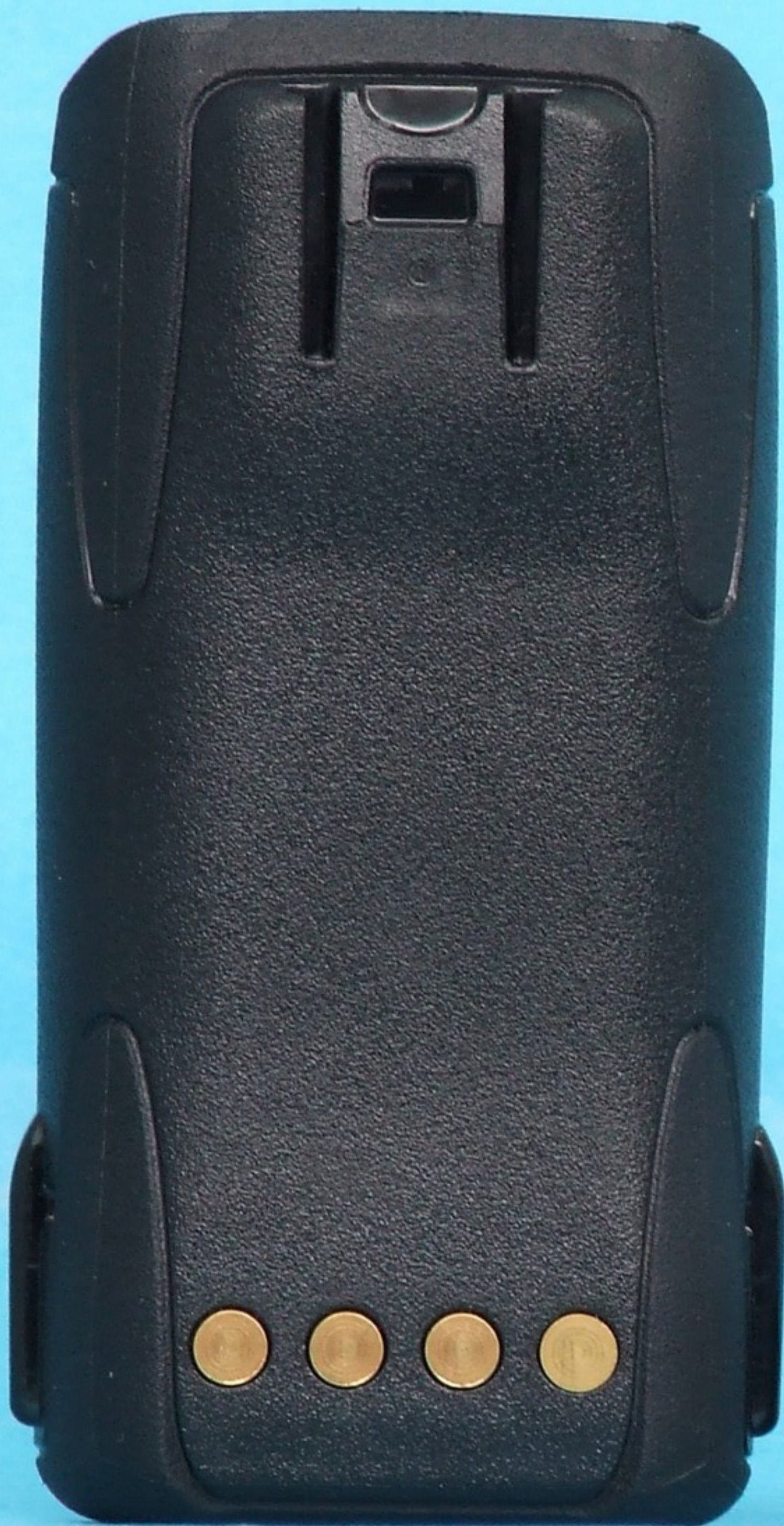
Battery Rear View