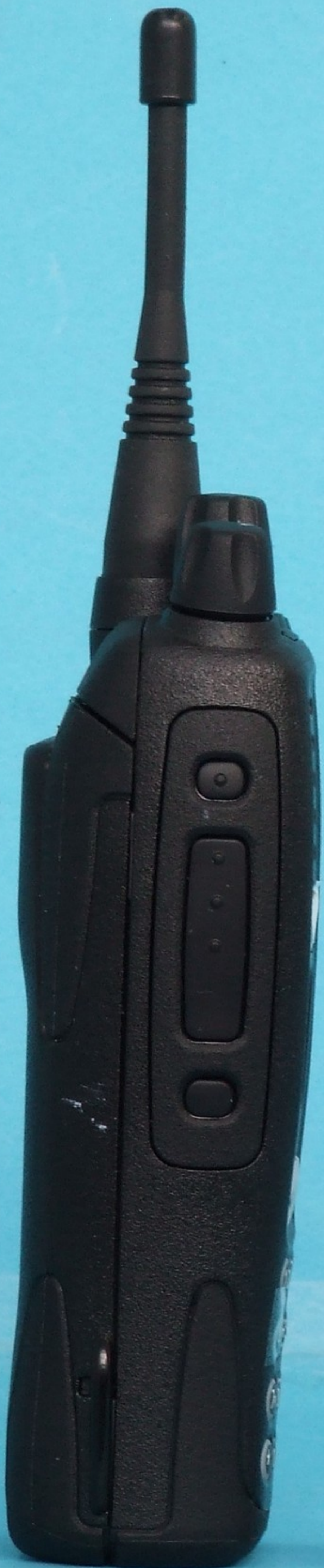
Left Hand Side View