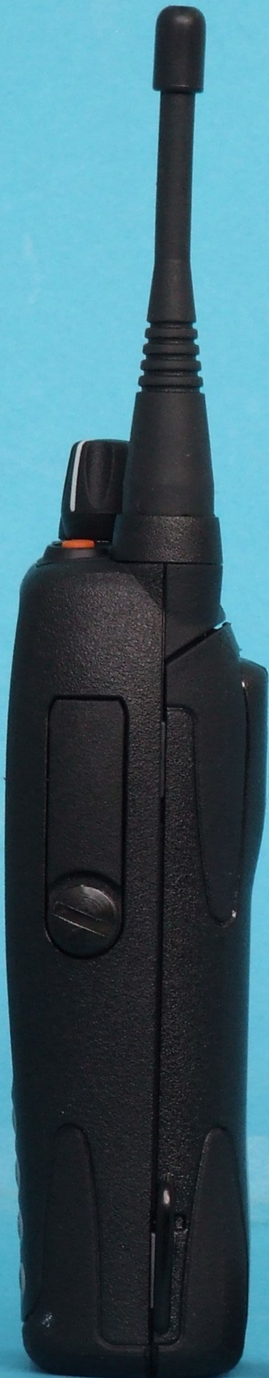
Right Hand Side View