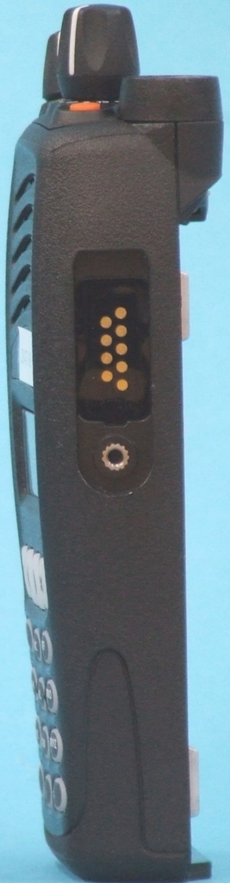
Right Hand Side View Battery Removed