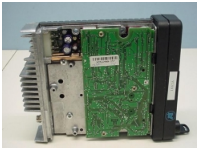
Logic PCB as fitted to chassis, complete unit minus covers