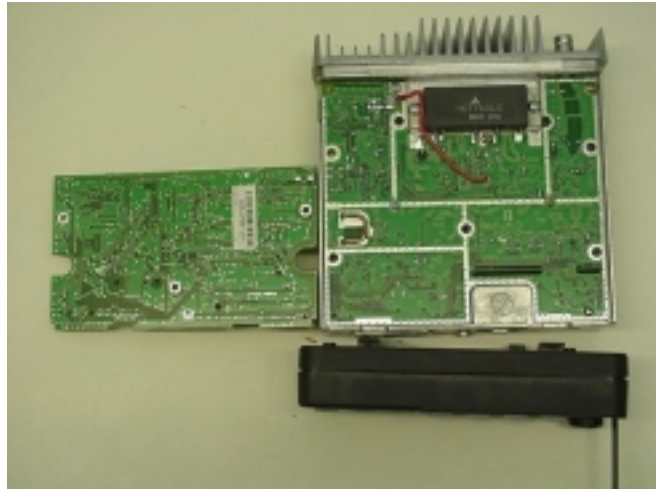
Bottom of logic PCB and Main PCB looking from bottom