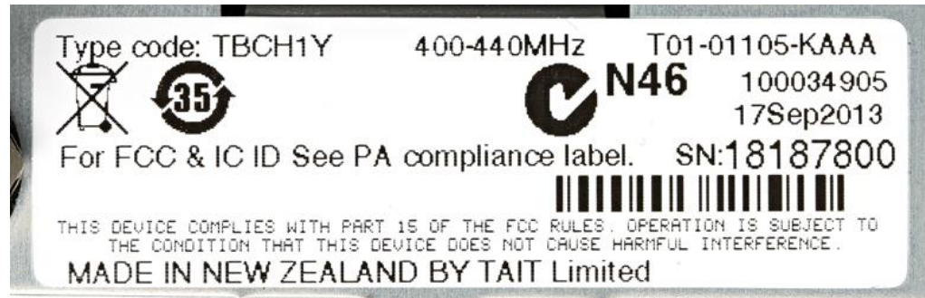
Photograph 03: Reciter module (400-440MHz) - Compliance label