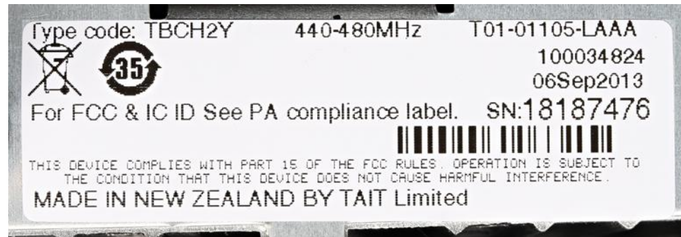
Photograph 04: Reciter module (440-480MHz) - Compliance label