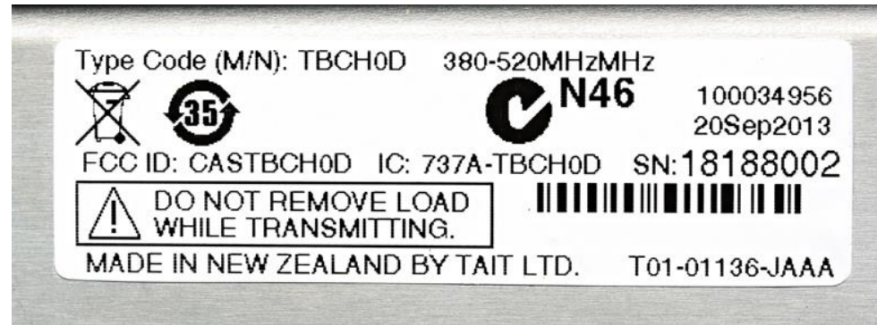
Photograph 05: 50W PA module (380-520MHz) - Compliance label