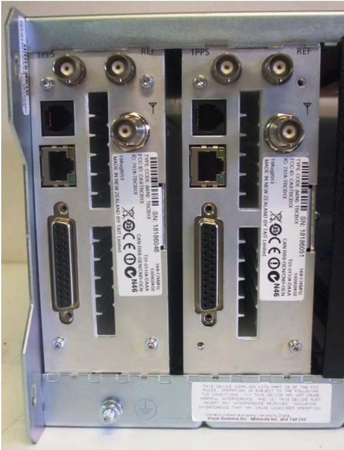
2 Receiver modules in the rack rear view