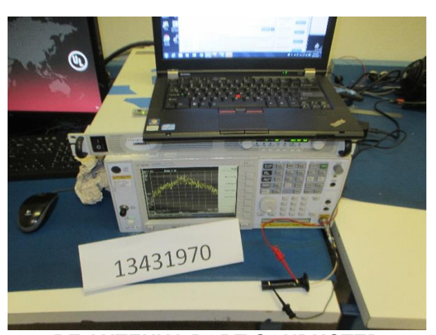
RF ANTENNA PORT CONDUCTED