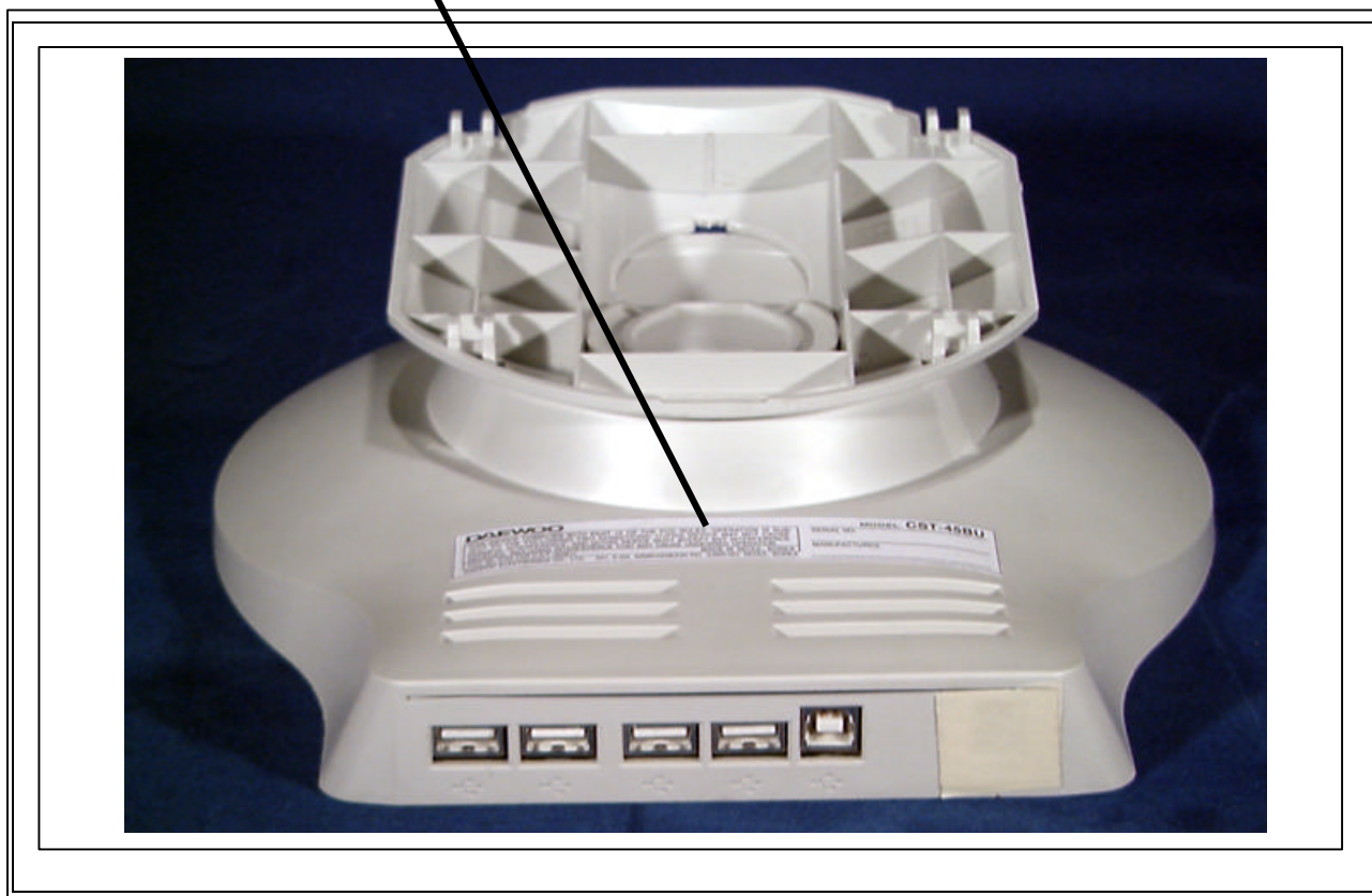
Fig 12. Sample label

The Label shown shall be permanently affixed at a conspicuous location on the device and be readily visible to the user at the time of purchase.