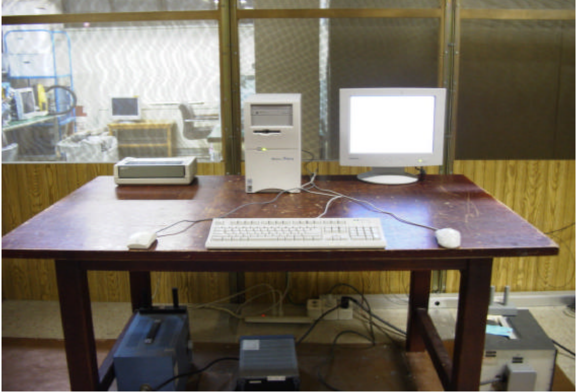
Conducted Emission 450kHz ~ 30MHz