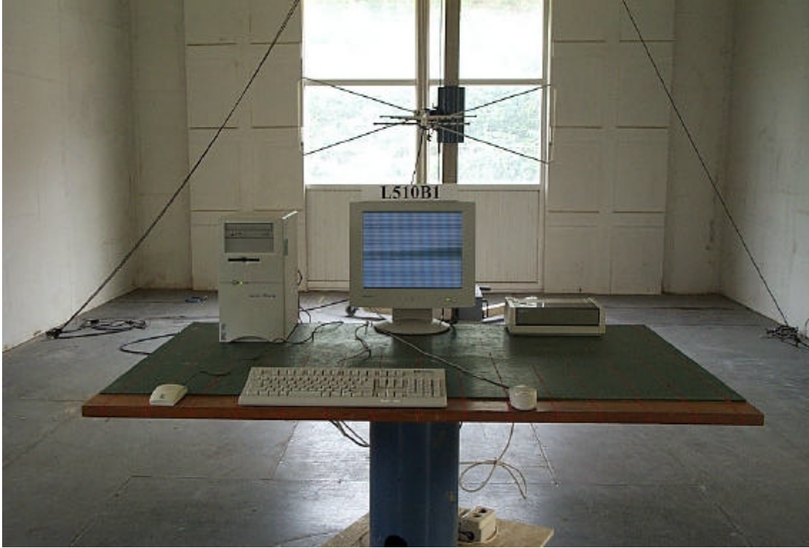
Radiated Emission 30MHz ~ 1000MHz