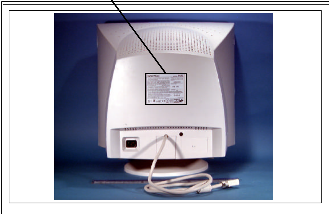
Fig 12. Sample label

The Label shown shall be permanently affixed at a conspicuous location on the device and be readily visible to the user at the time of purchase.