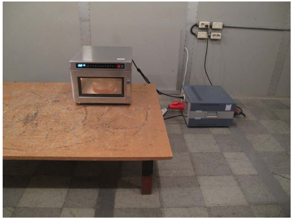
• Conducted Test Picture (Rear)