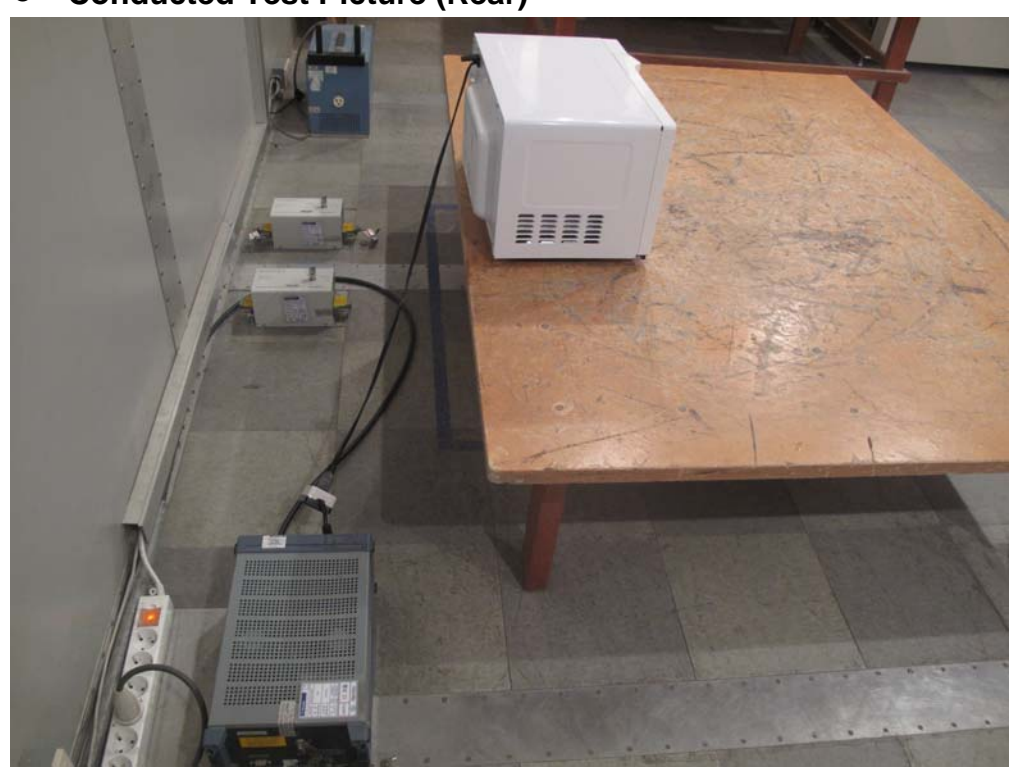
Daewoo Electronics Corporation FCC ID: C5F7NF6LMO700N