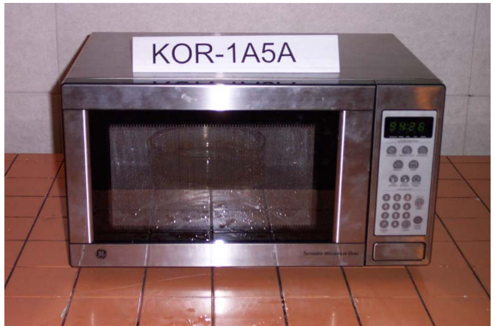
Daewoo Electronics Corporation. FCC ID:C5F7NF1AM0110N