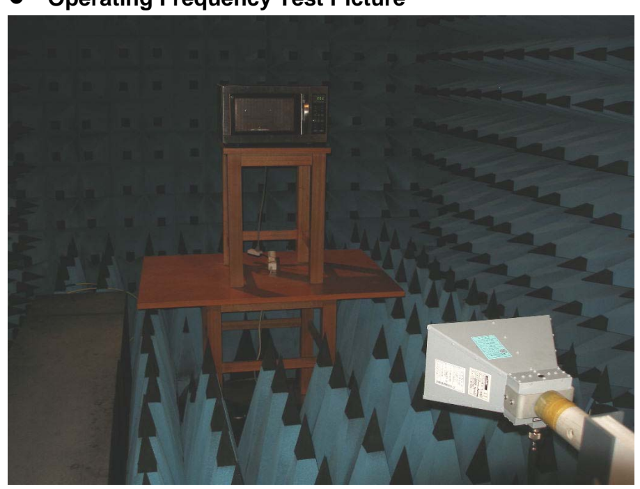
Daewoo Electronics Corporation FCC ID: C5F7NF18MO110N