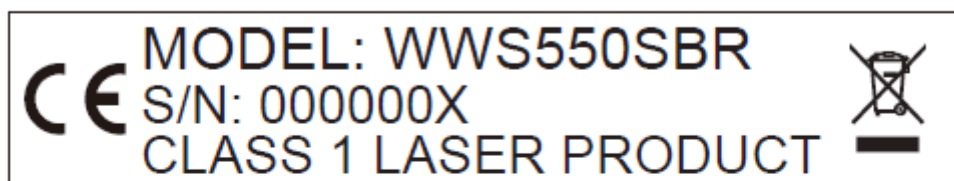
Product Label #2

FCC ID: C53WWS550SBR Rating: DC 5.0V, 1.2A