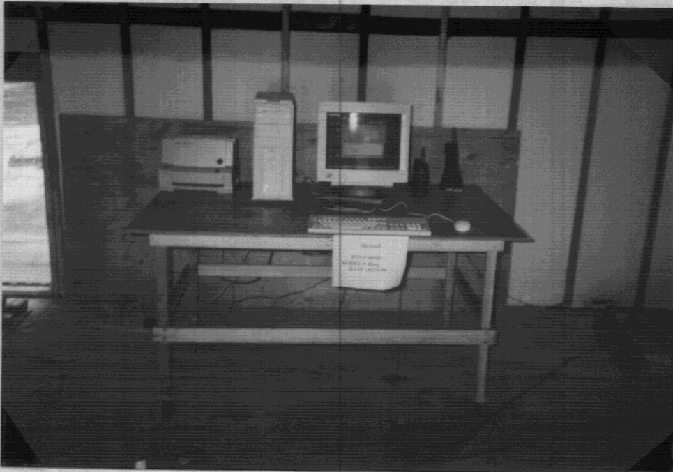
Conducted Emissions - Front View

Applicant: Microsoft Corporation Equipment: 900 MHz Cordless Phone Model Number: Microsoft Phone