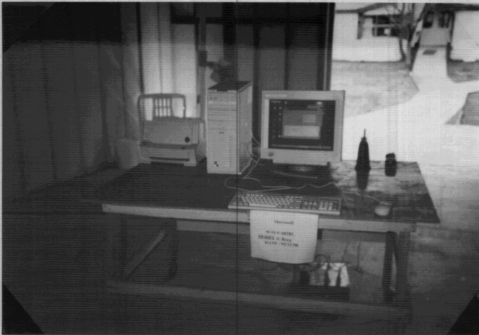
Radiated Emissions - Back View

Applicant: Microsoft Corporation Equipment: 900 MHz Cordless Phone Model Number: Microsoft Phone