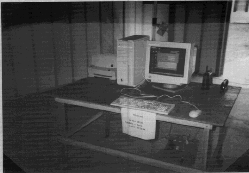
Radiated Emissions - Front View

Applicant: Microsoft Corporation Equipment: 900 MHz Cordless Phone Model Number: Microsoft Phone