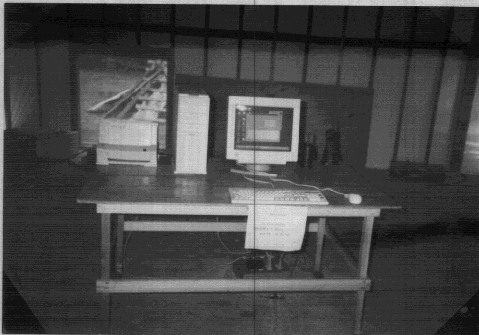
Radiated Emissions - Front View

Applicant: Microsoft Corporation Equipment: 900 MHz Cordless Phone Model Number: Microsoft Phone