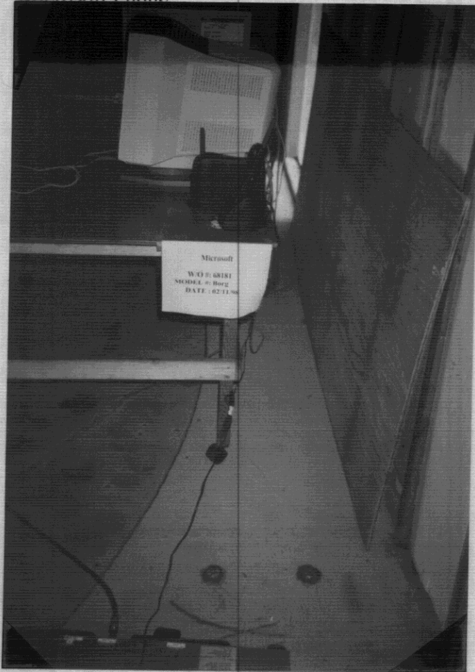
Conducted Emissions - Back View

Applicant: Microsoft Corporation Equipment: 900 MHz Cordless Phone Model Number: Microsoft Phone