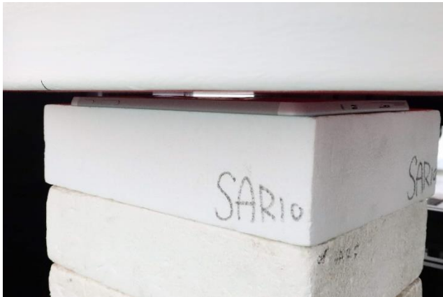
Bottom Face at 4 mm