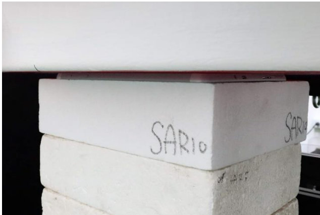
Bottom Face at 0 mm