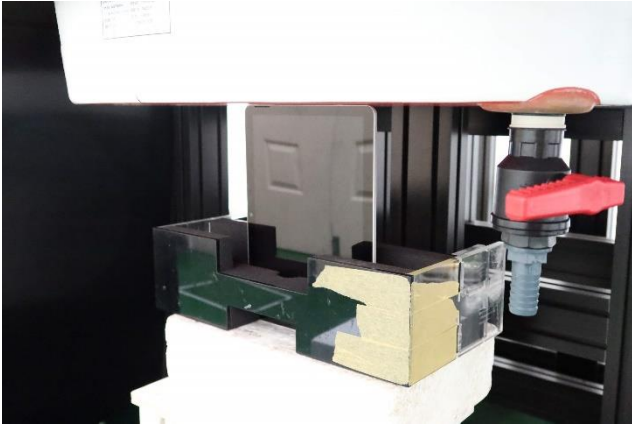
Edge2 at 0 mm