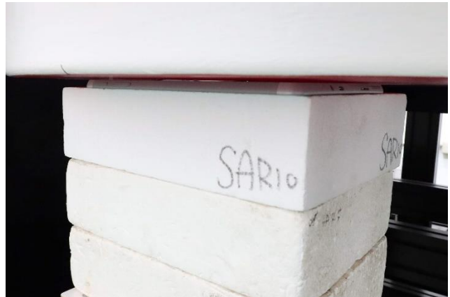
Bottom Face at 2 mm