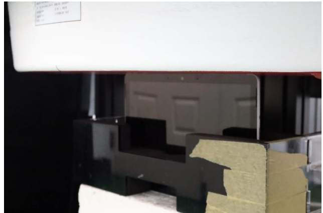
Edge1 at 0 mm