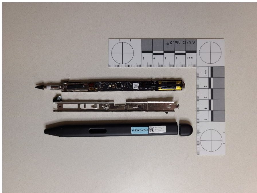
EUT Chassis – View 2