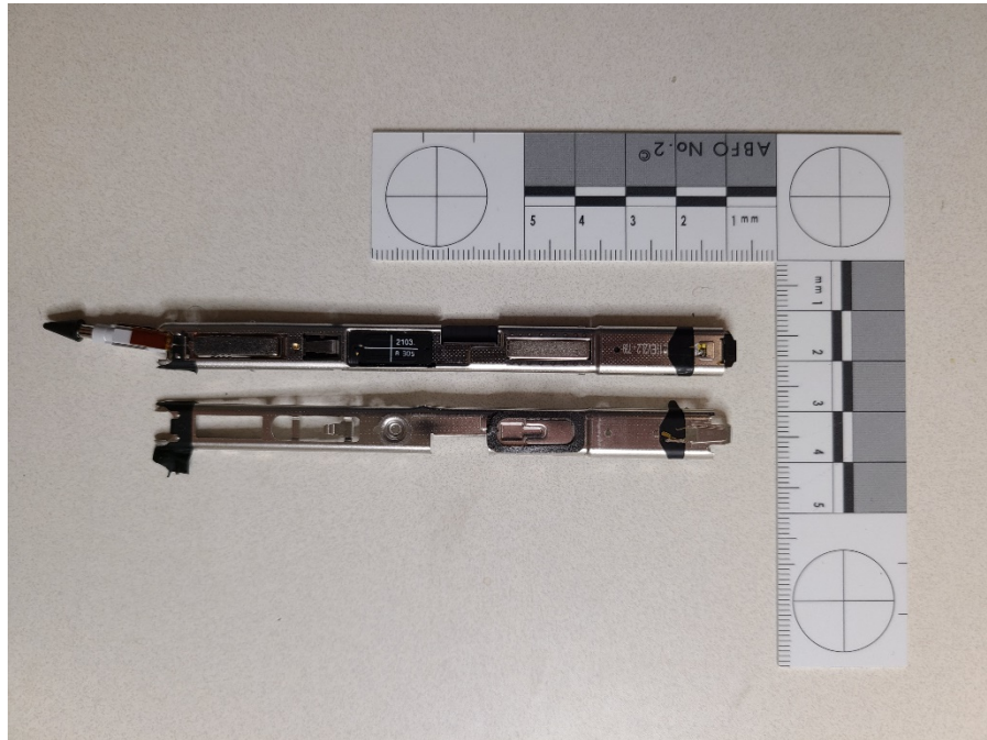
EUT Chassis – View 1