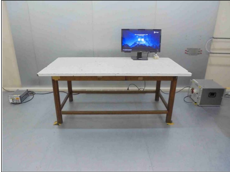
Conducted Emission Test (Mode A)