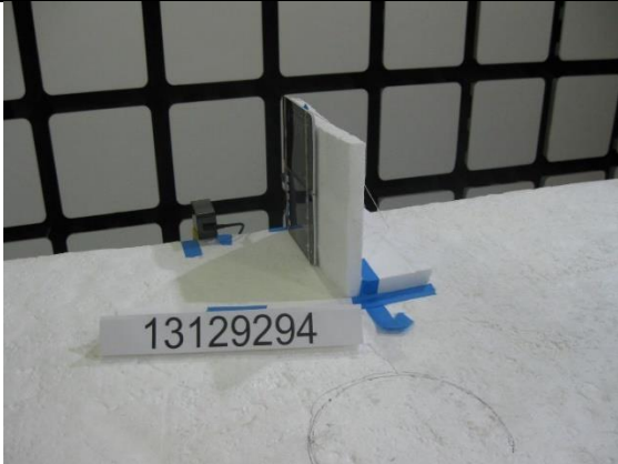
Y-AXIS FRONT PHOTO (Above 1GHz Bands)