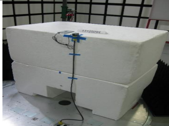
X-AXIS BACK PHOTO (Below 1GHz Bands)