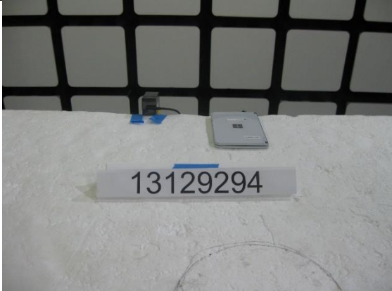
X-AXIS FRONT PHOTO (Below 1GHz Bands)