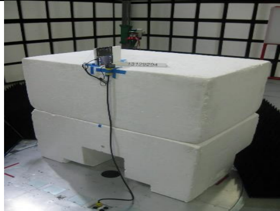
Y-AXIS BACK PHOTO (Above 1GHz Bands)