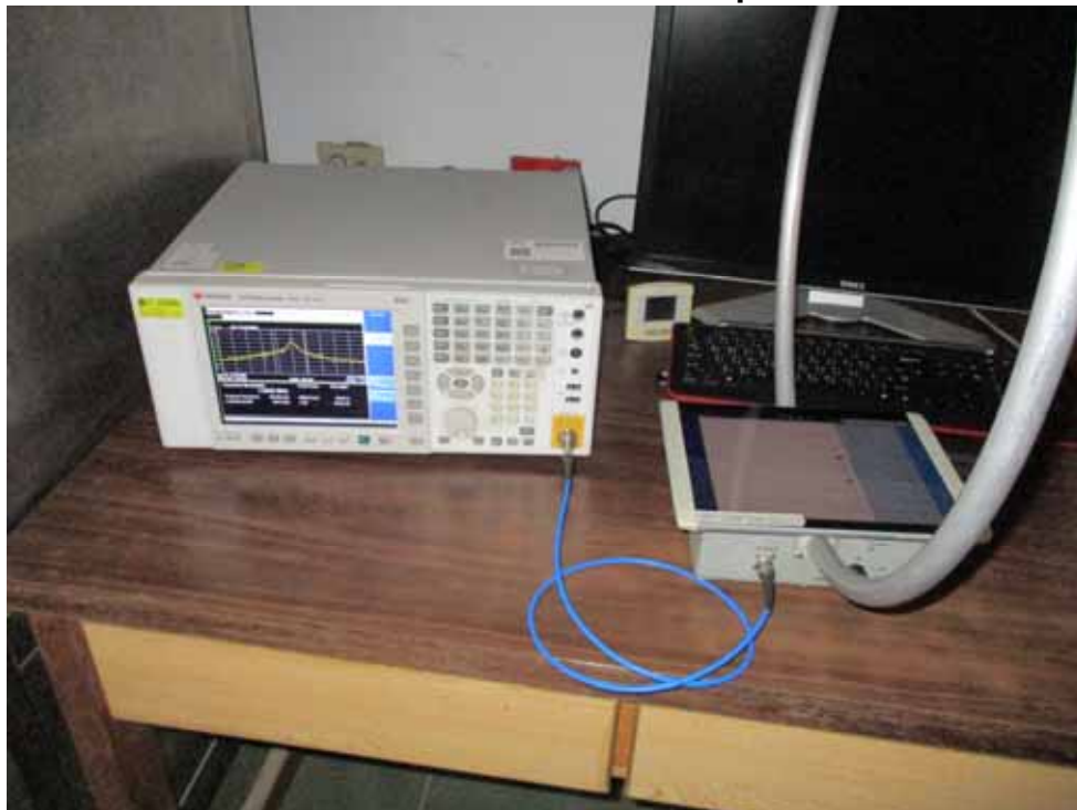
Frequency stability Setup Photo