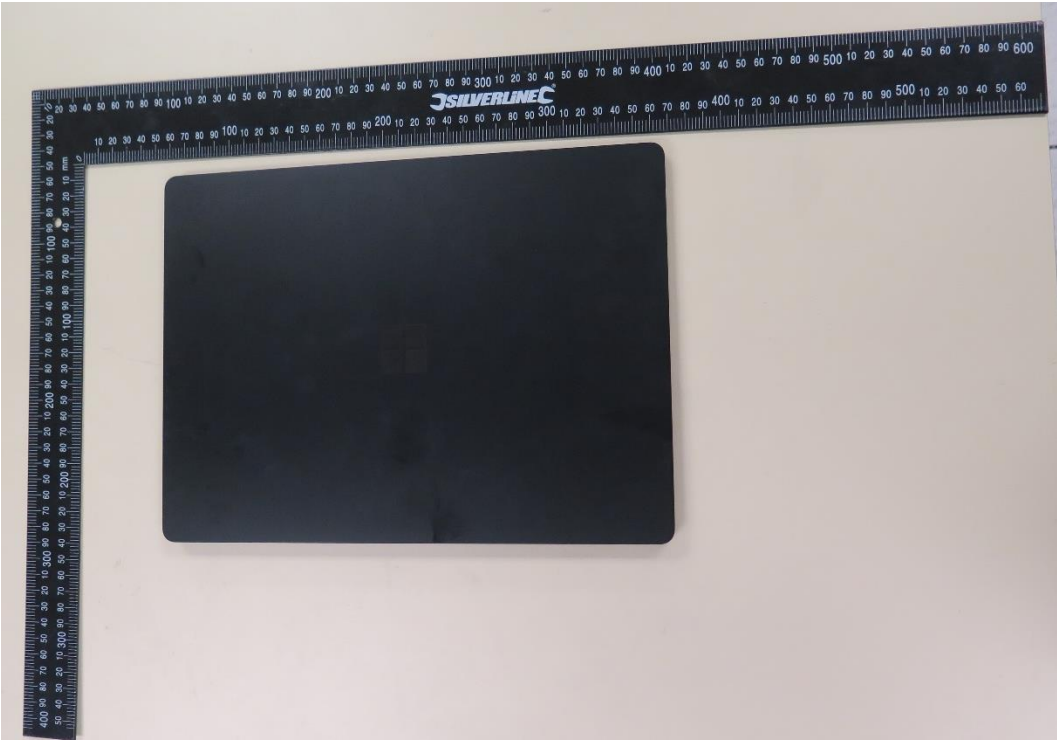
EUT- View 1