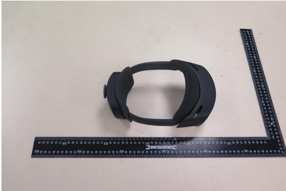
EUT- View 1