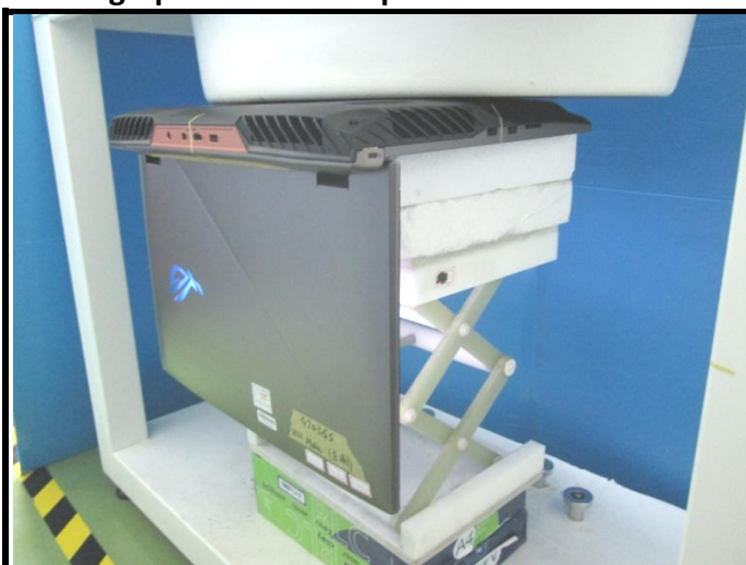
Body - Bottom of EUT at 0 mm