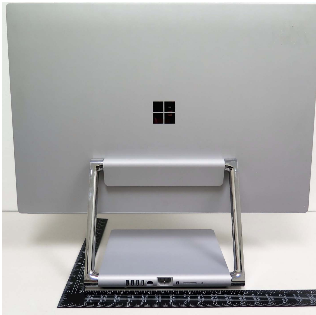
Fig.2. EUT Back Side