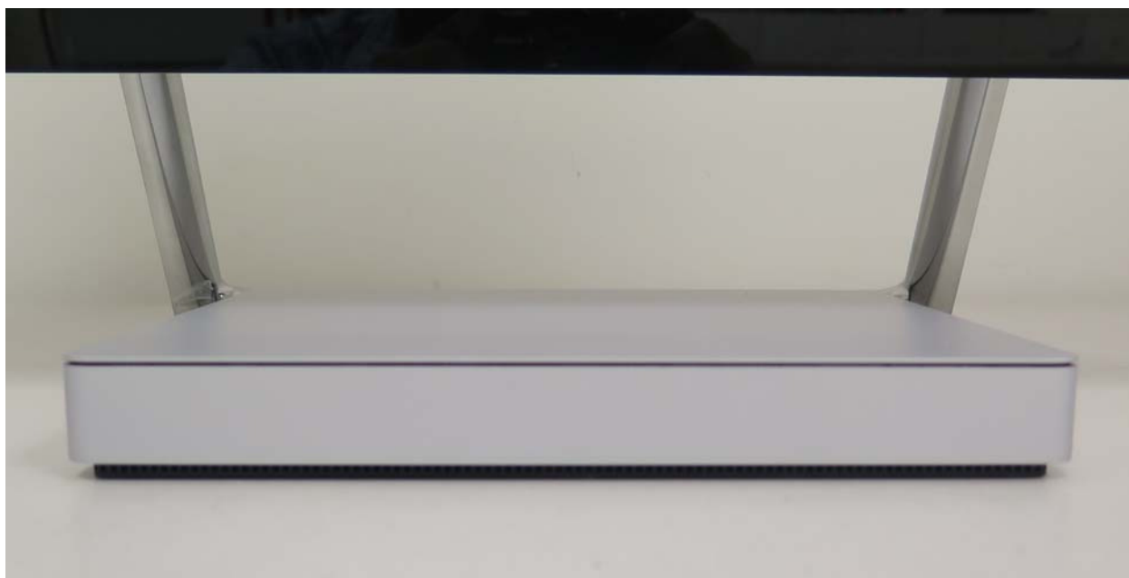
Fig.6. Front PC View