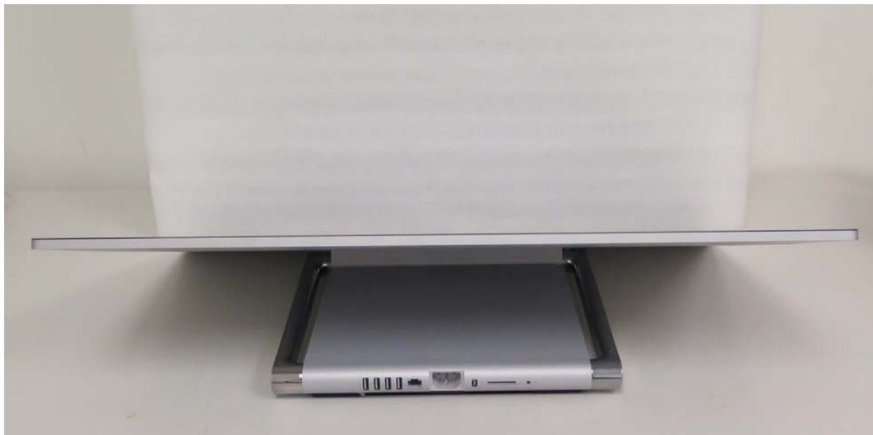
Fig.5. Top View