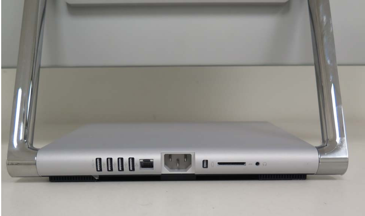
Fig.7. Back PC View