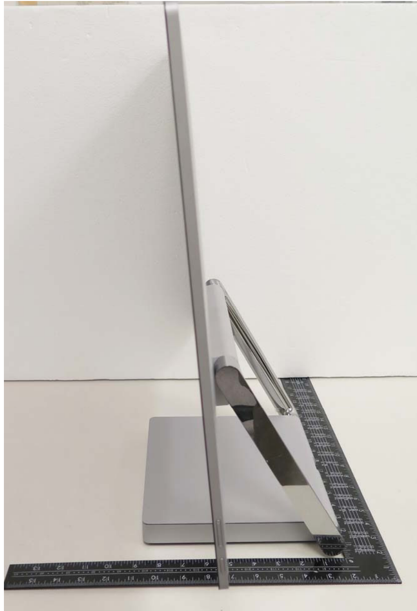
Fig.3. Side View