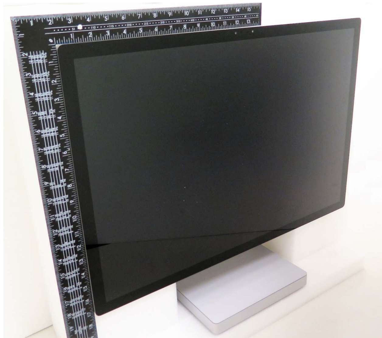
Fig.1. EUT Front Side