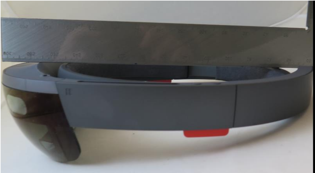
Right side of EUT