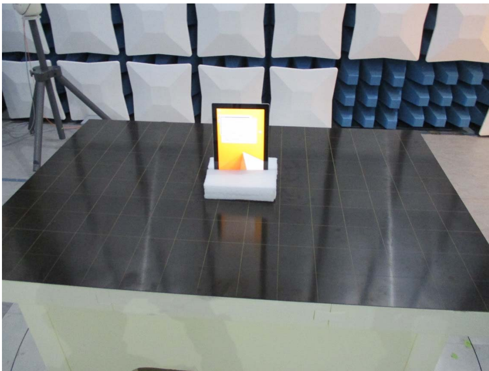
Fig.2 Radiated Spurious Emissions EUT Setup (Standing)