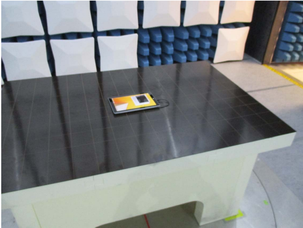
Fig.1 Radiated Spurious Emissions EUT Setup (Flat)