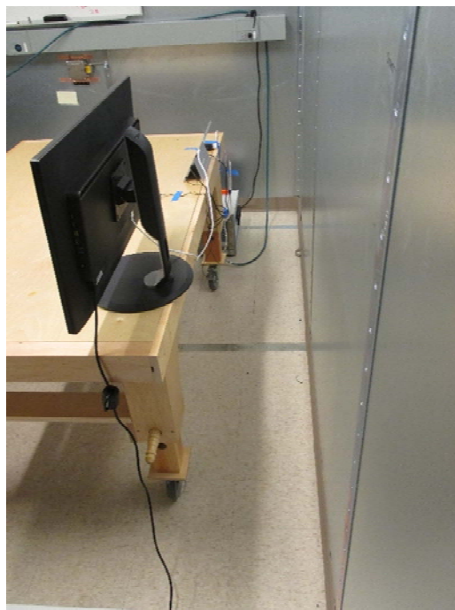
Fig.9 AC Line Conducted Emissions Measurements Test Setup