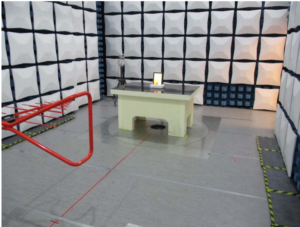
Fig.4 Radiated Spurious Emissions Test Setup (30MHz – 1GHz)