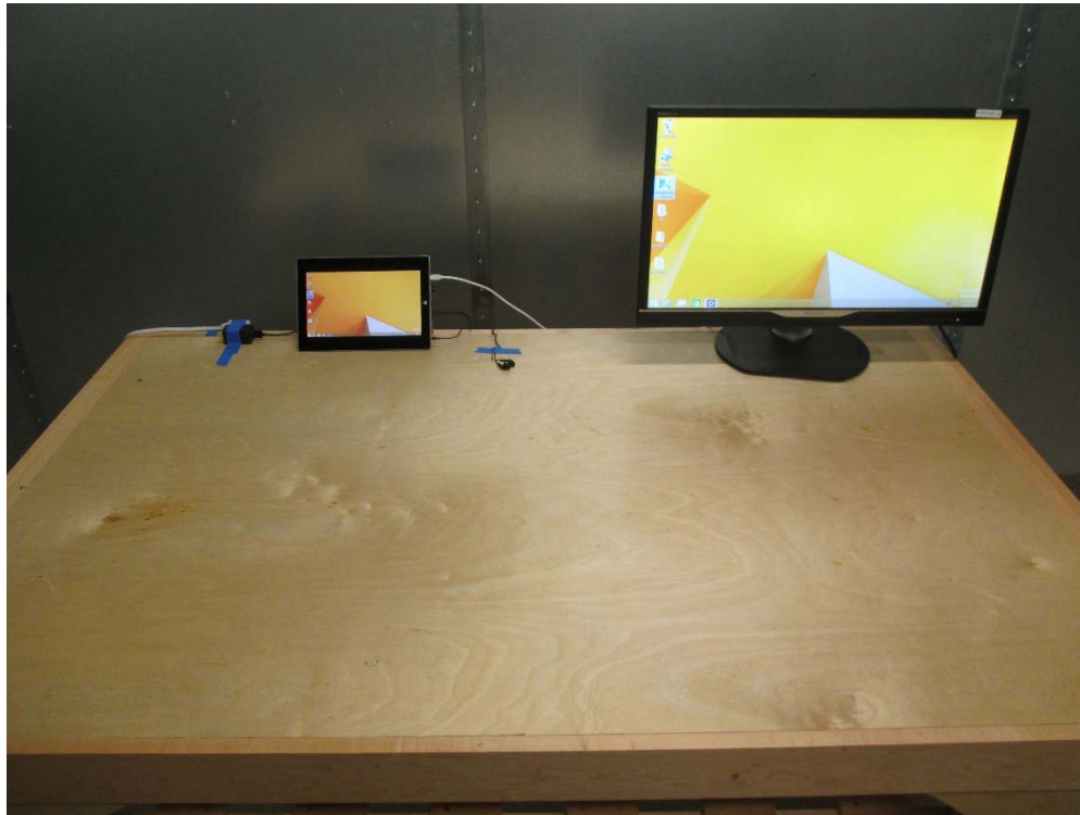
Fig.8 AC Line Conducted Emissions Measurements Test Setup