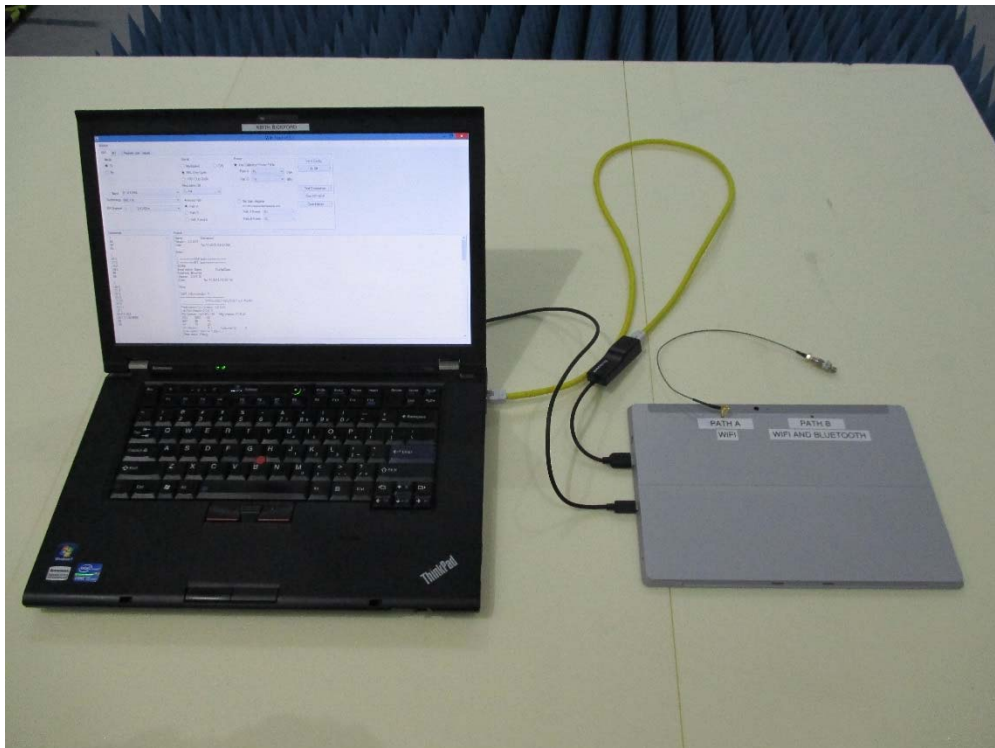
Fig.7 Antenna port Conducted Measurements Test Setup